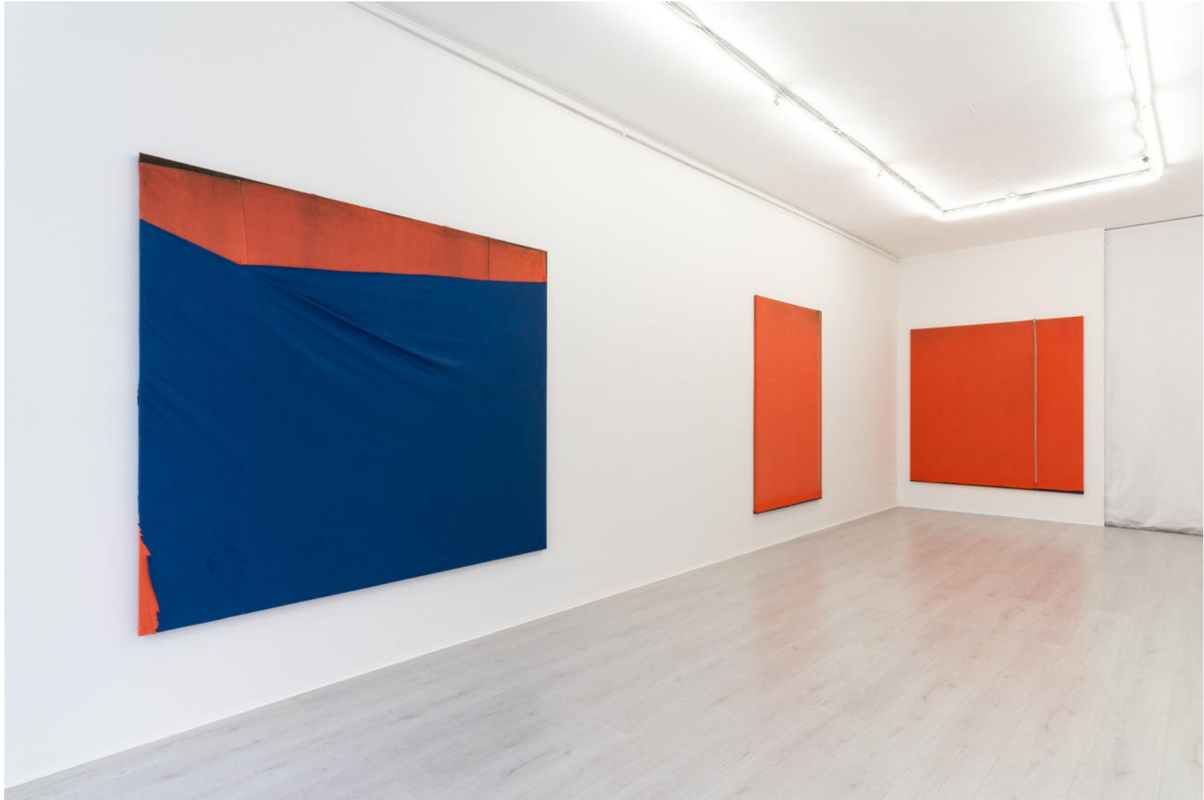
Skinny Dipping, A+B Gallery, Brescia IT, 2018