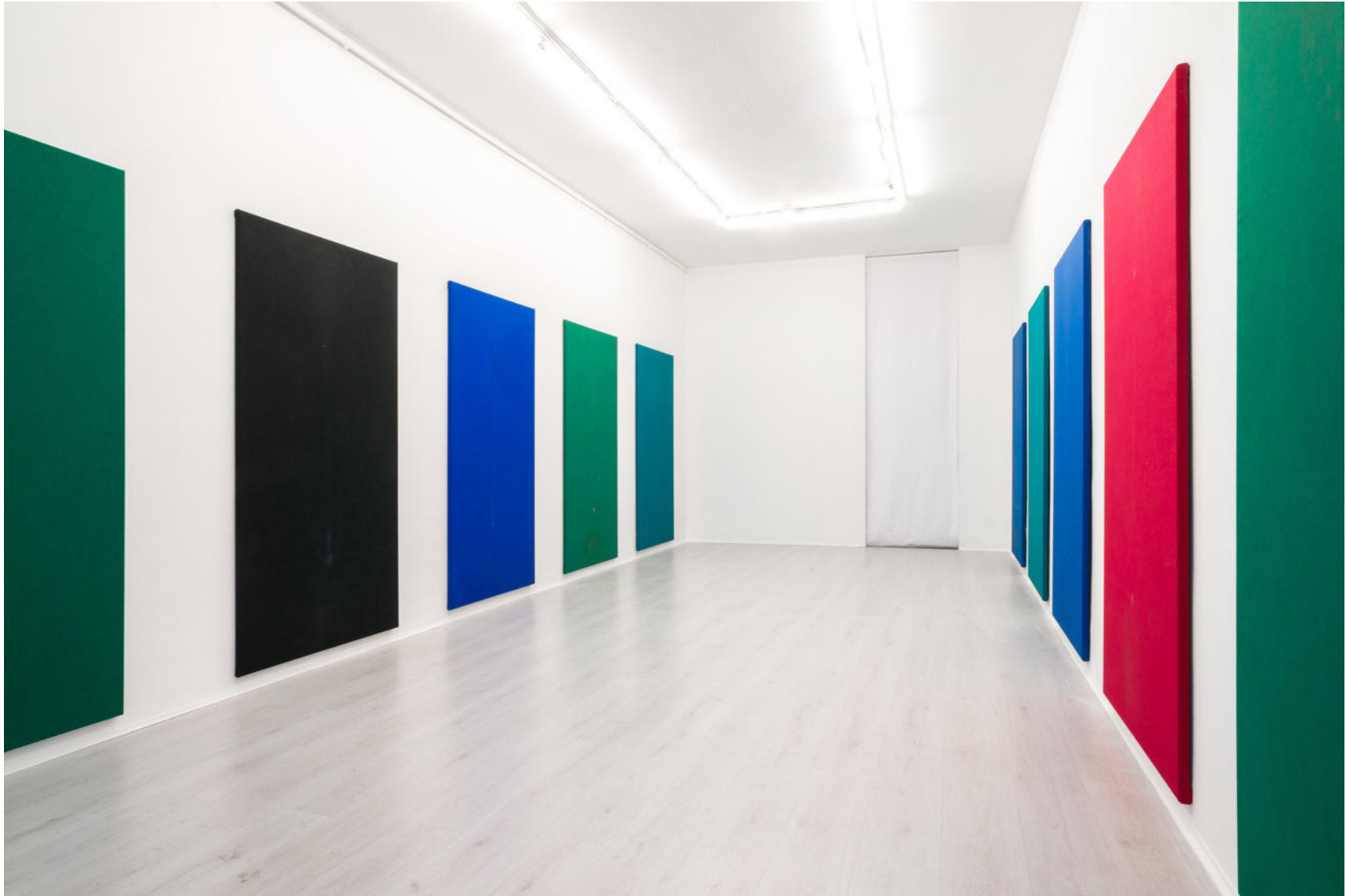
Six Milion Way to Die, A+B Gallery, Brescia IT, 2017