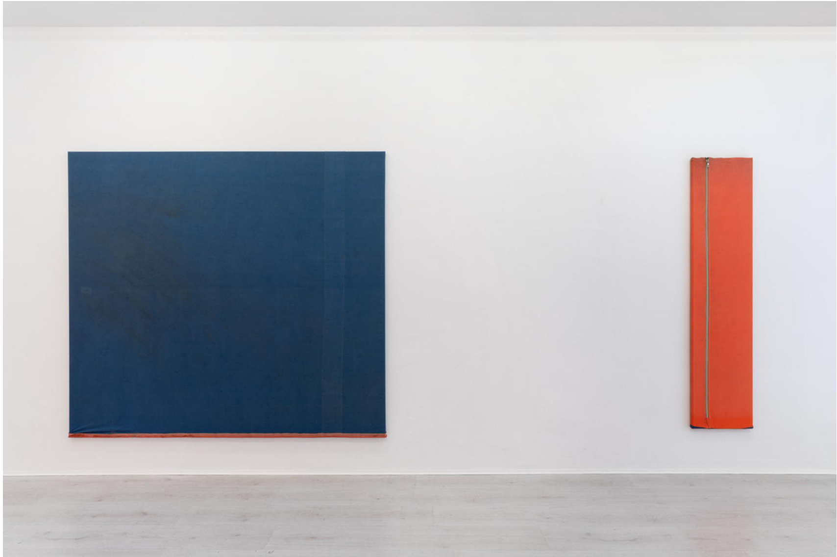
Skinny Dipping, A+B Gallery, Brescia IT, 2018