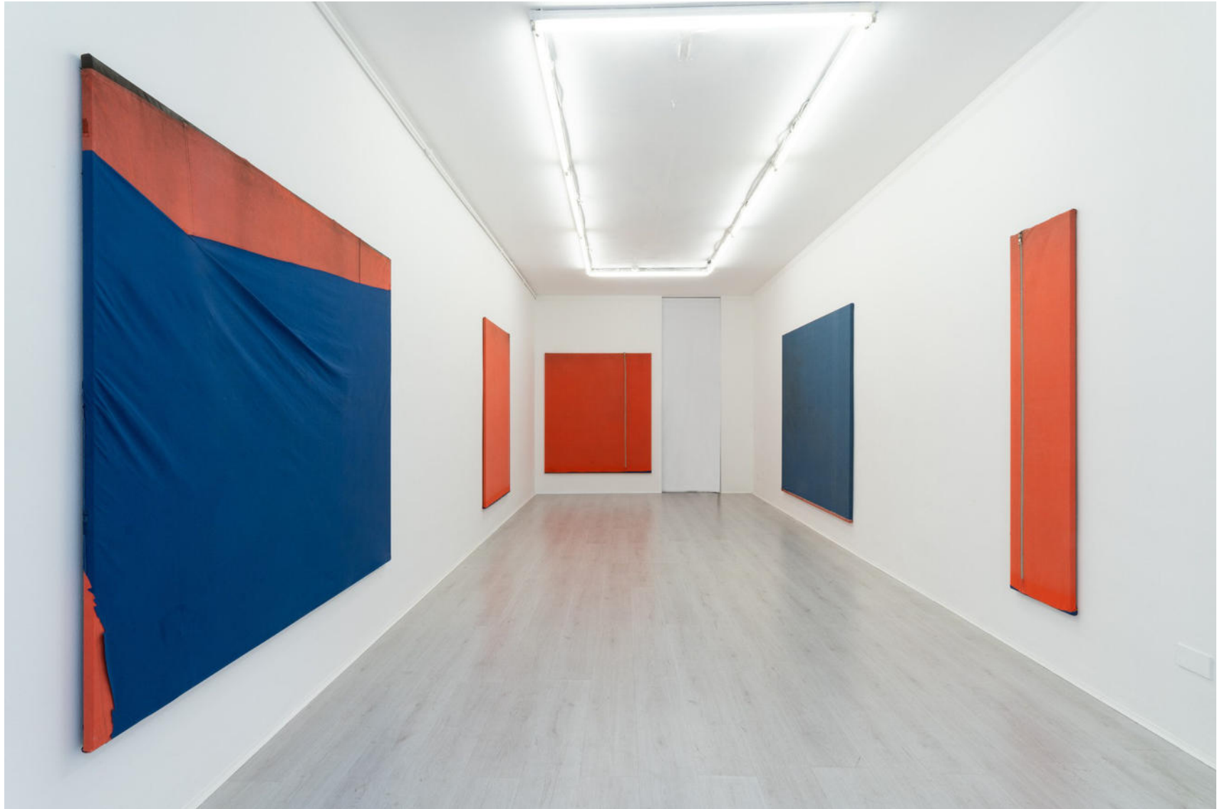
Skinny Dipping, A+B Gallery, Brescia IT, 2018