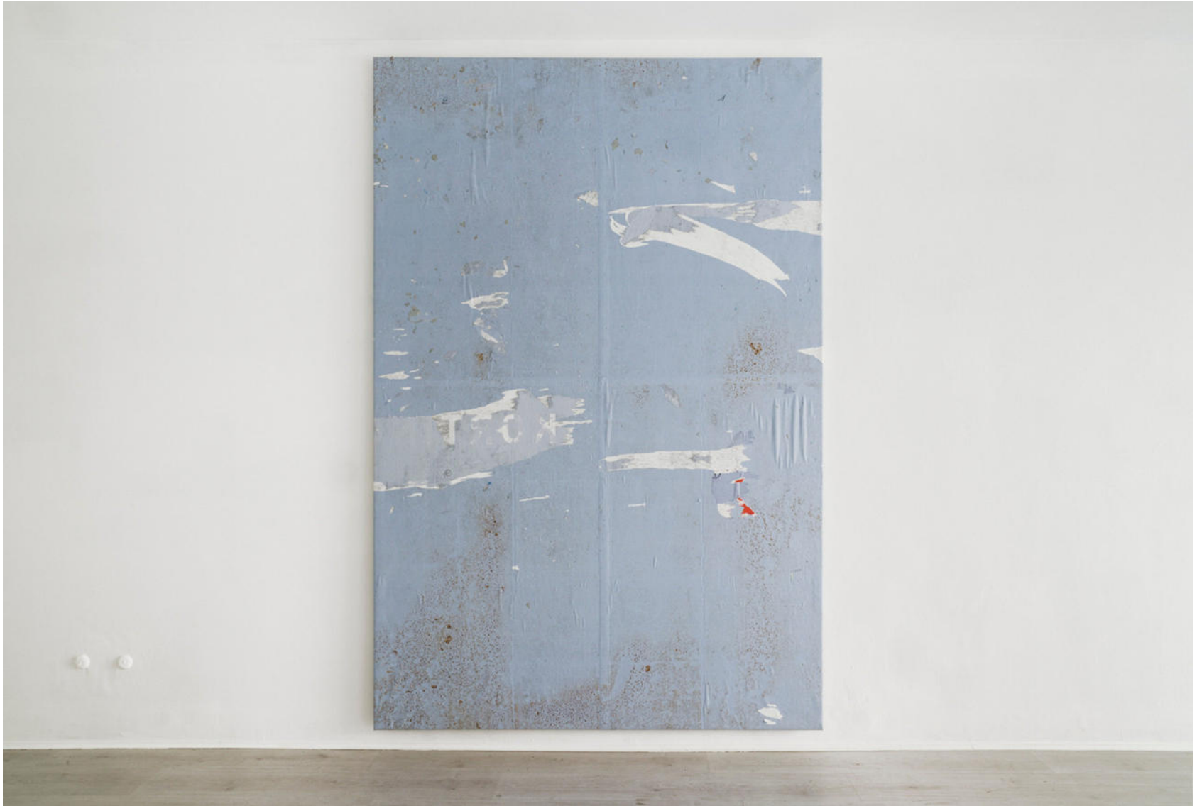
Imperialist, from the billboard series, 2016, billboard on aluminium stretcher, 290x200