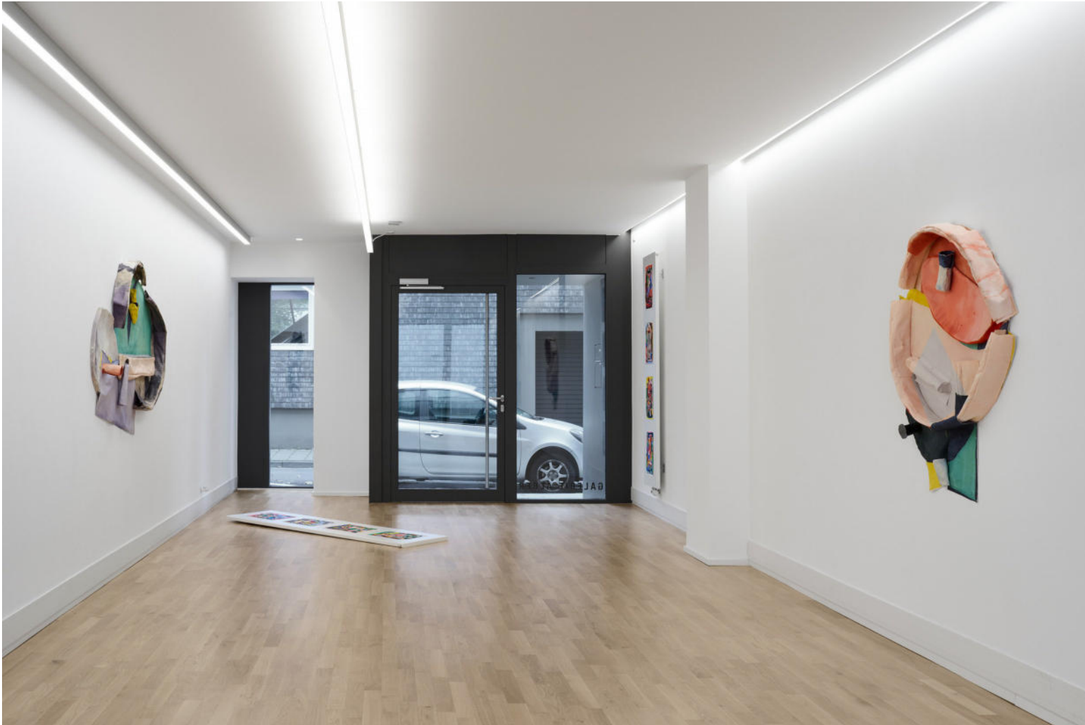
Fontaines, Galerie Alber, Cologne, 2021