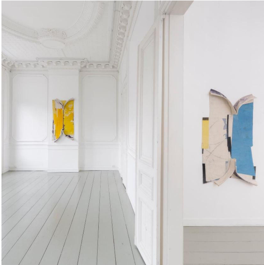
Early Bird, Geukens & De Vil Gallery, Antwerp, 2022