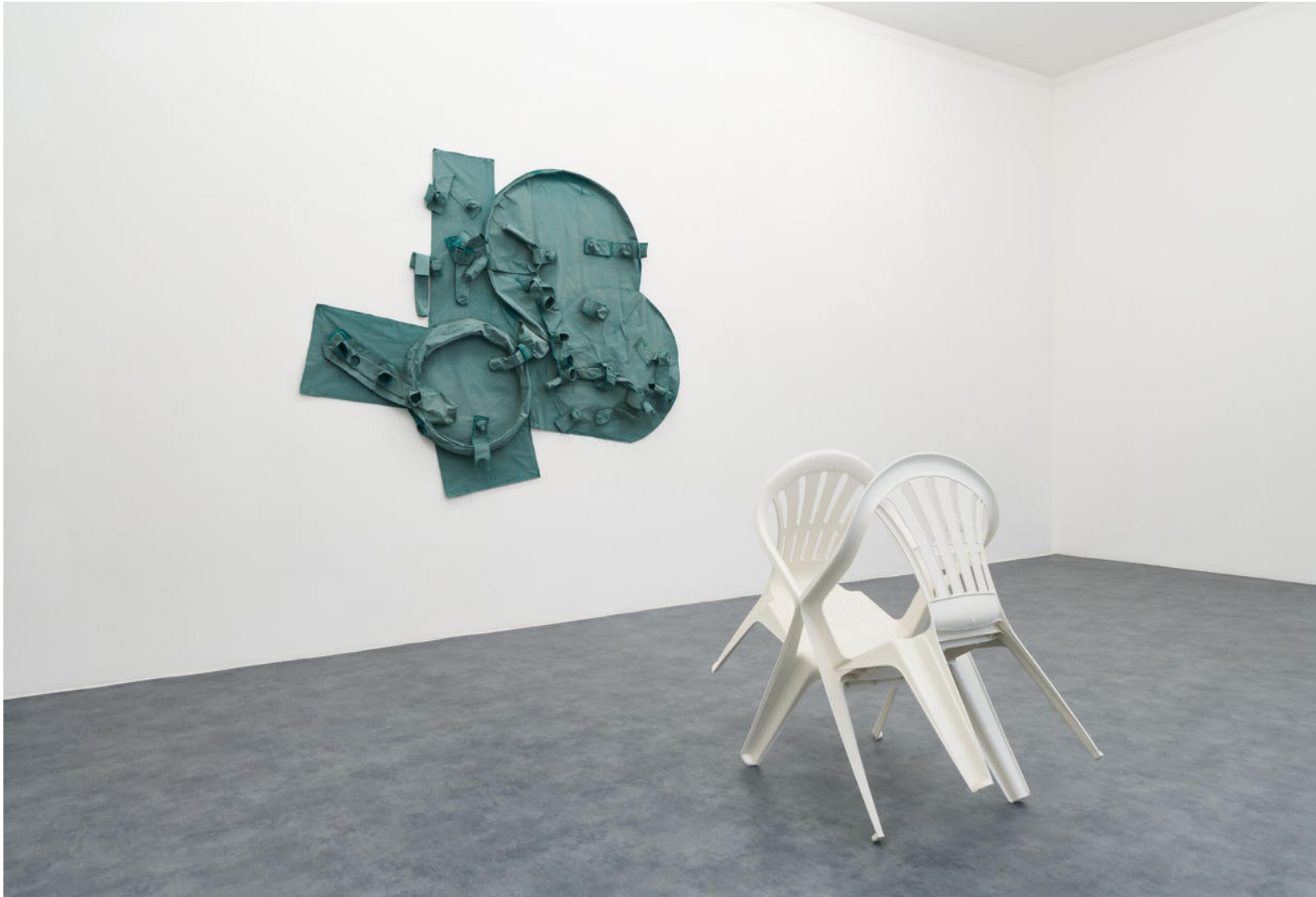
Sunbathing in the mud, A+B Gallery, Brescia, 2021