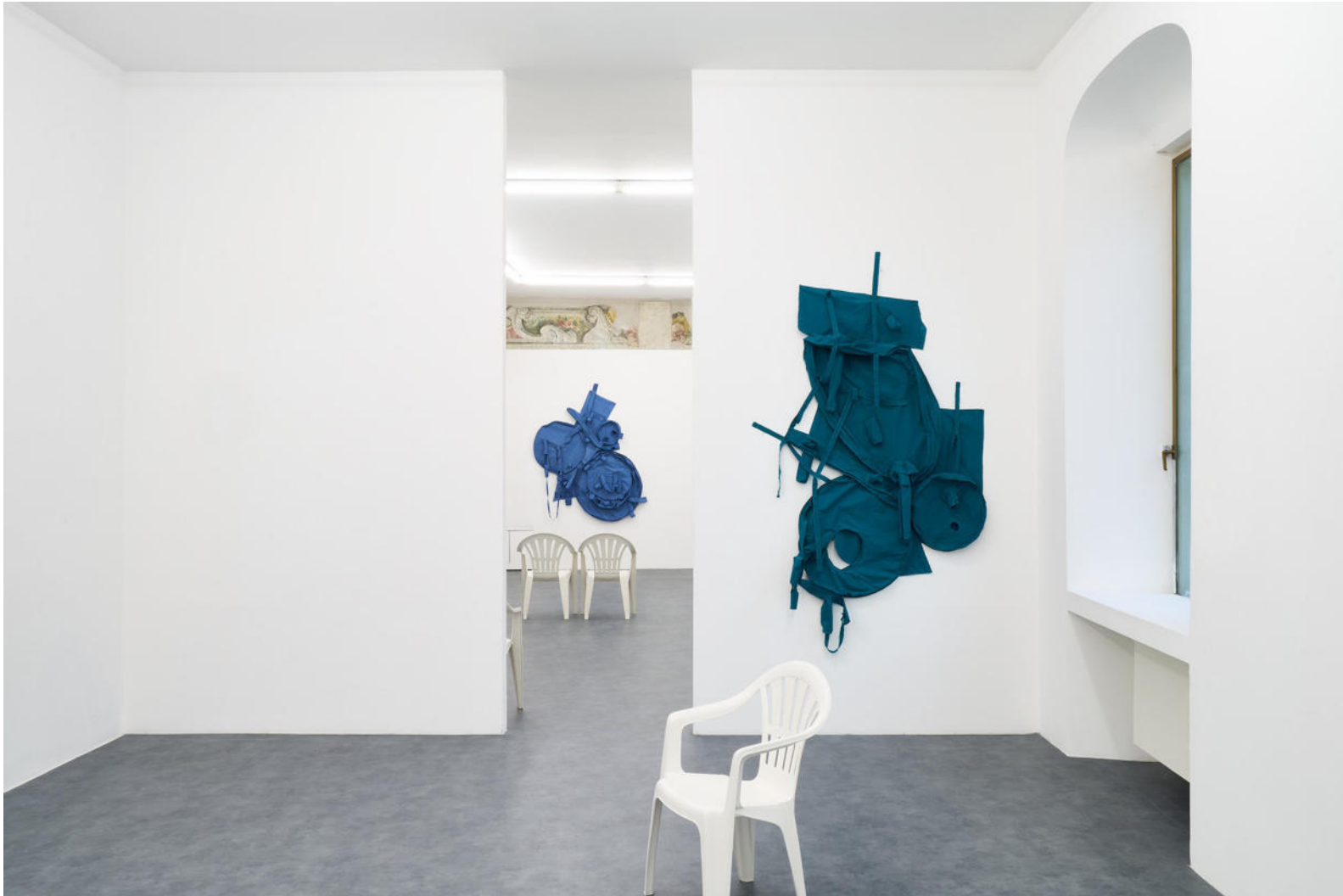
Sunbathing in the mud, A+B Gallery, Brescia, 2021