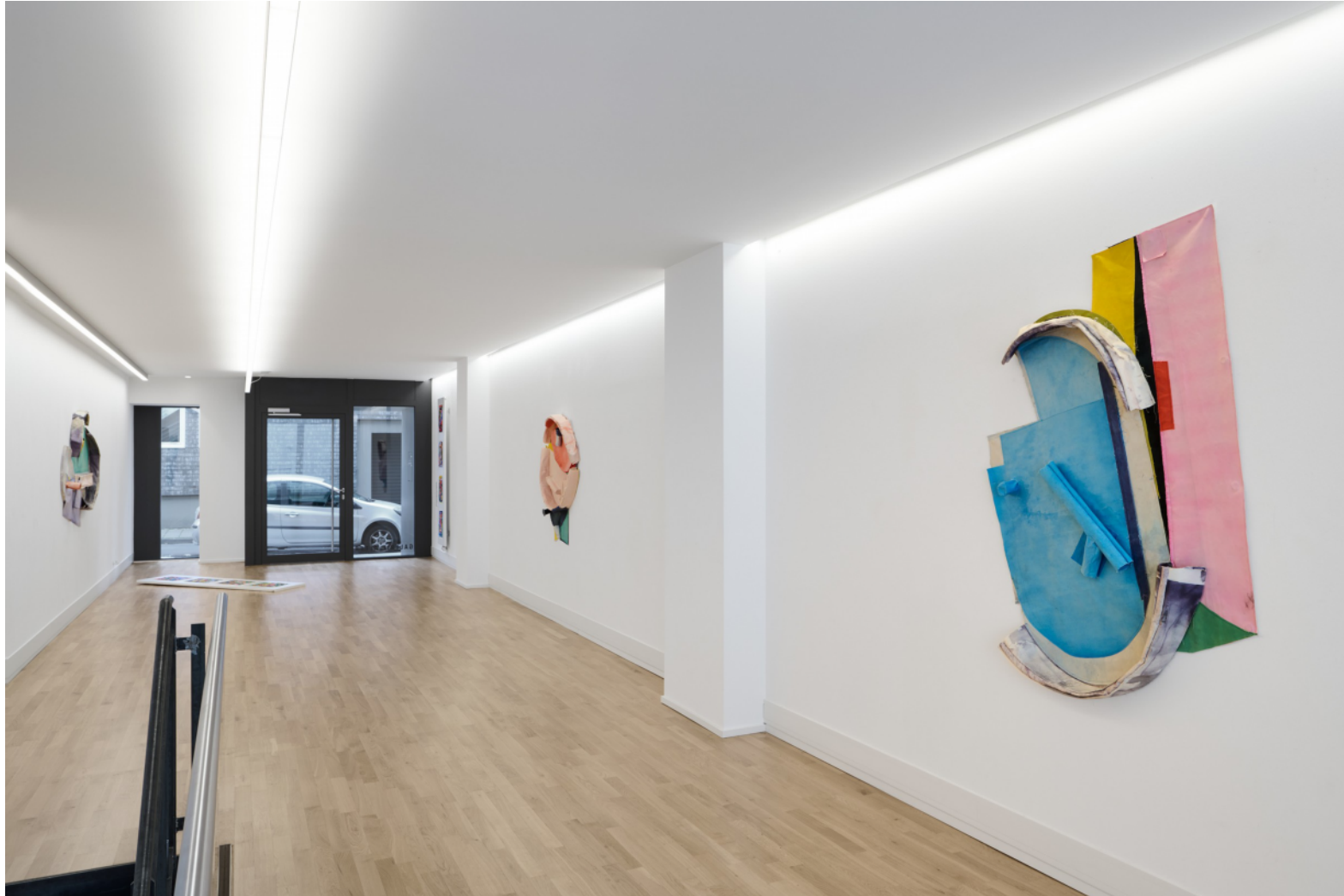
Fontaines, Galerie Alber, Cologne, 2021