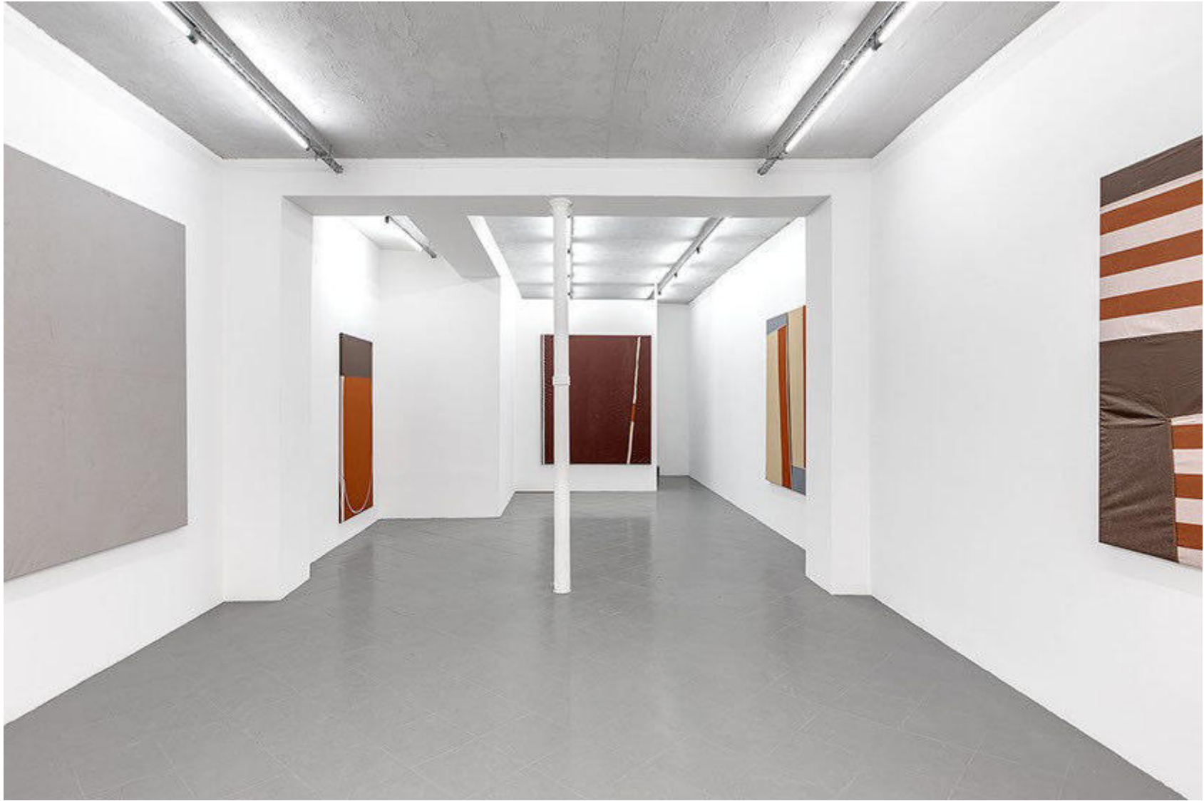
Rover, Galerie Jerome Pauchant, Paris, 2019