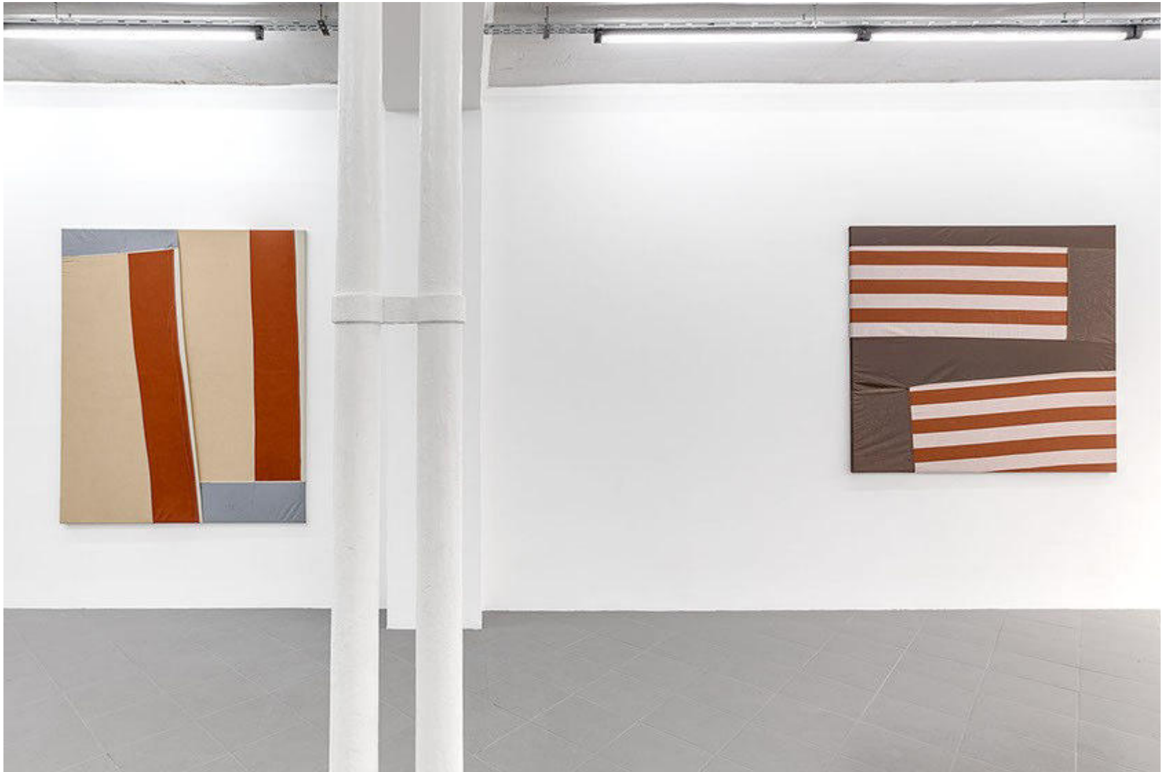
Rover, Galerie Jerome Pauchant, Paris, 2019