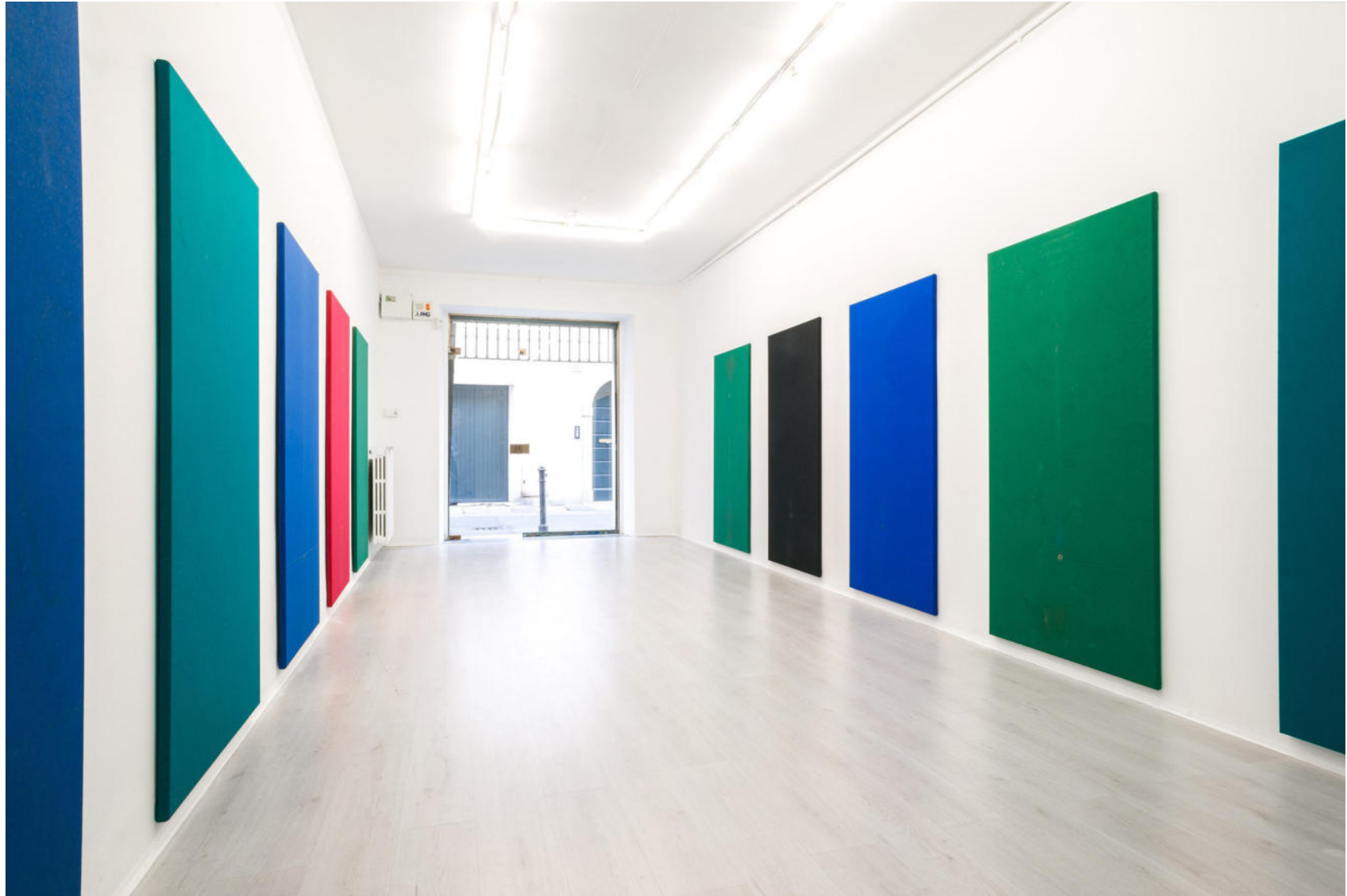
Six Million Way to Die, A+B Gallery, Brescia IT, 2017