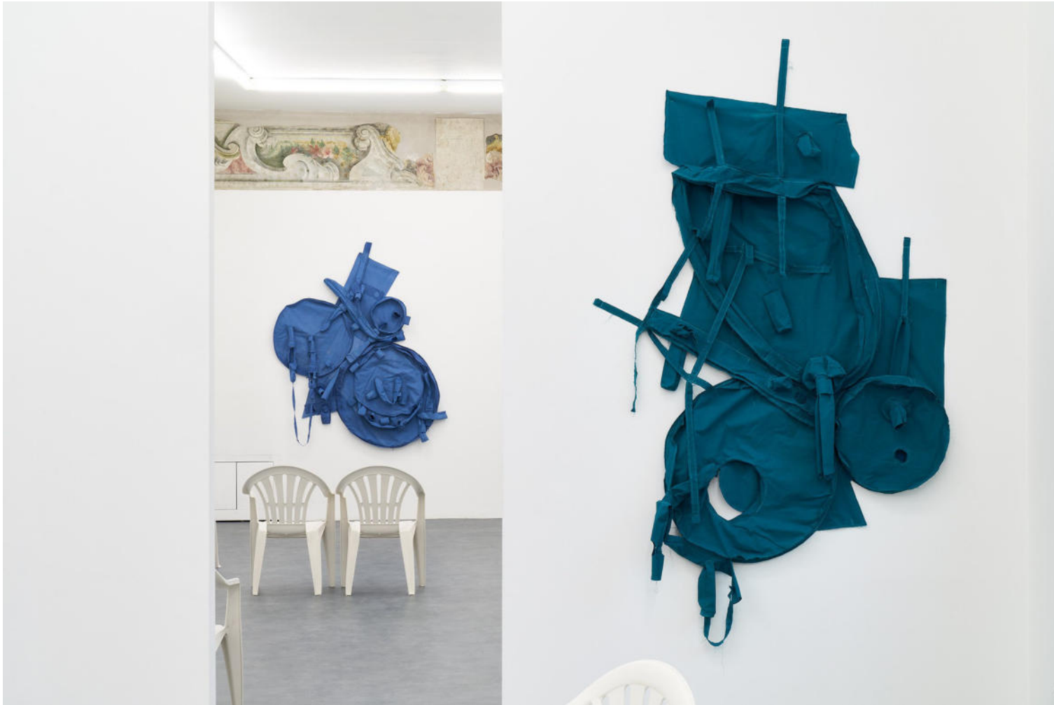
Sunbathing in the mud, A+B Gallery, Brescia, 2021