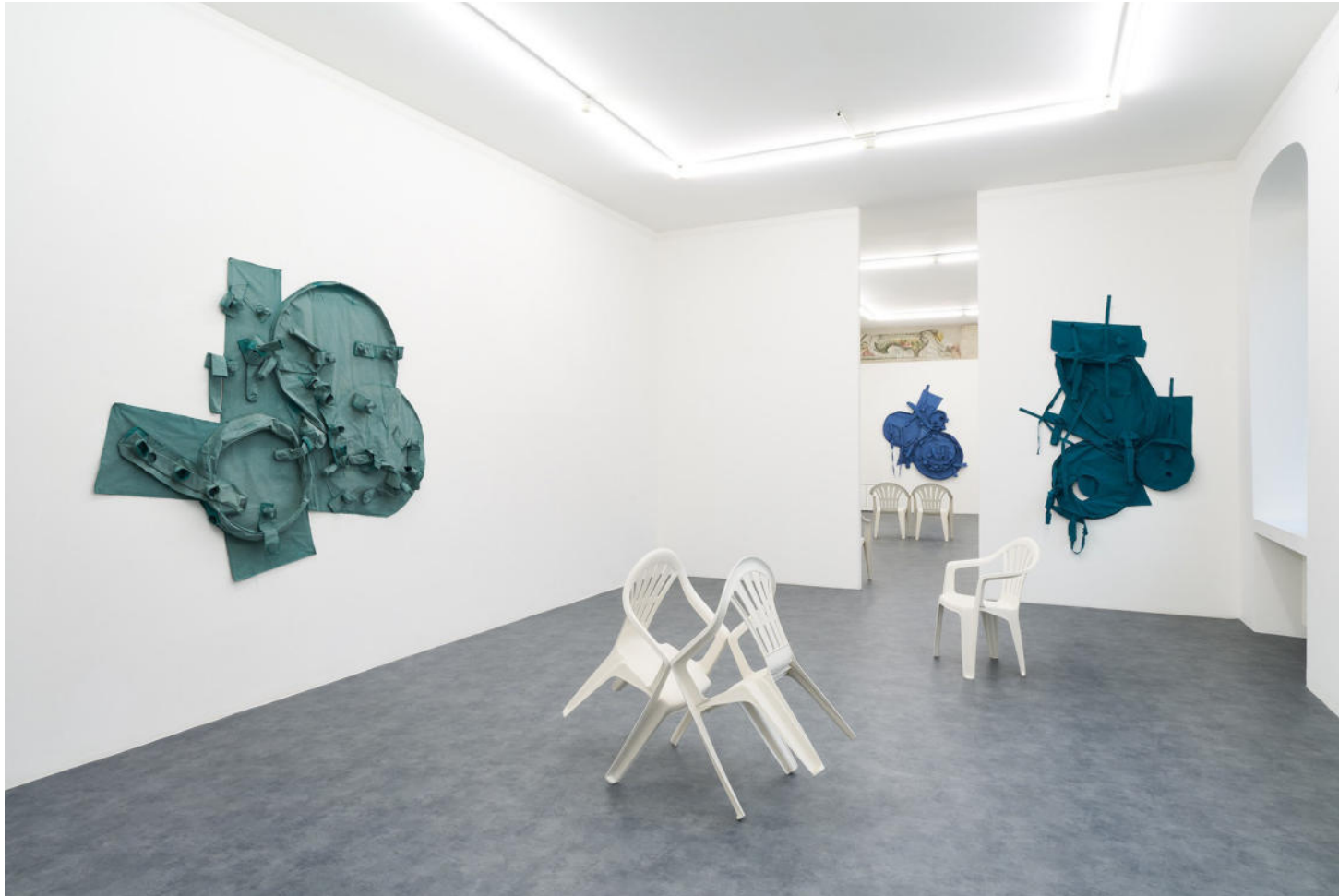
Sunbathing in the mud, A+B Gallery, Brescia, 2021