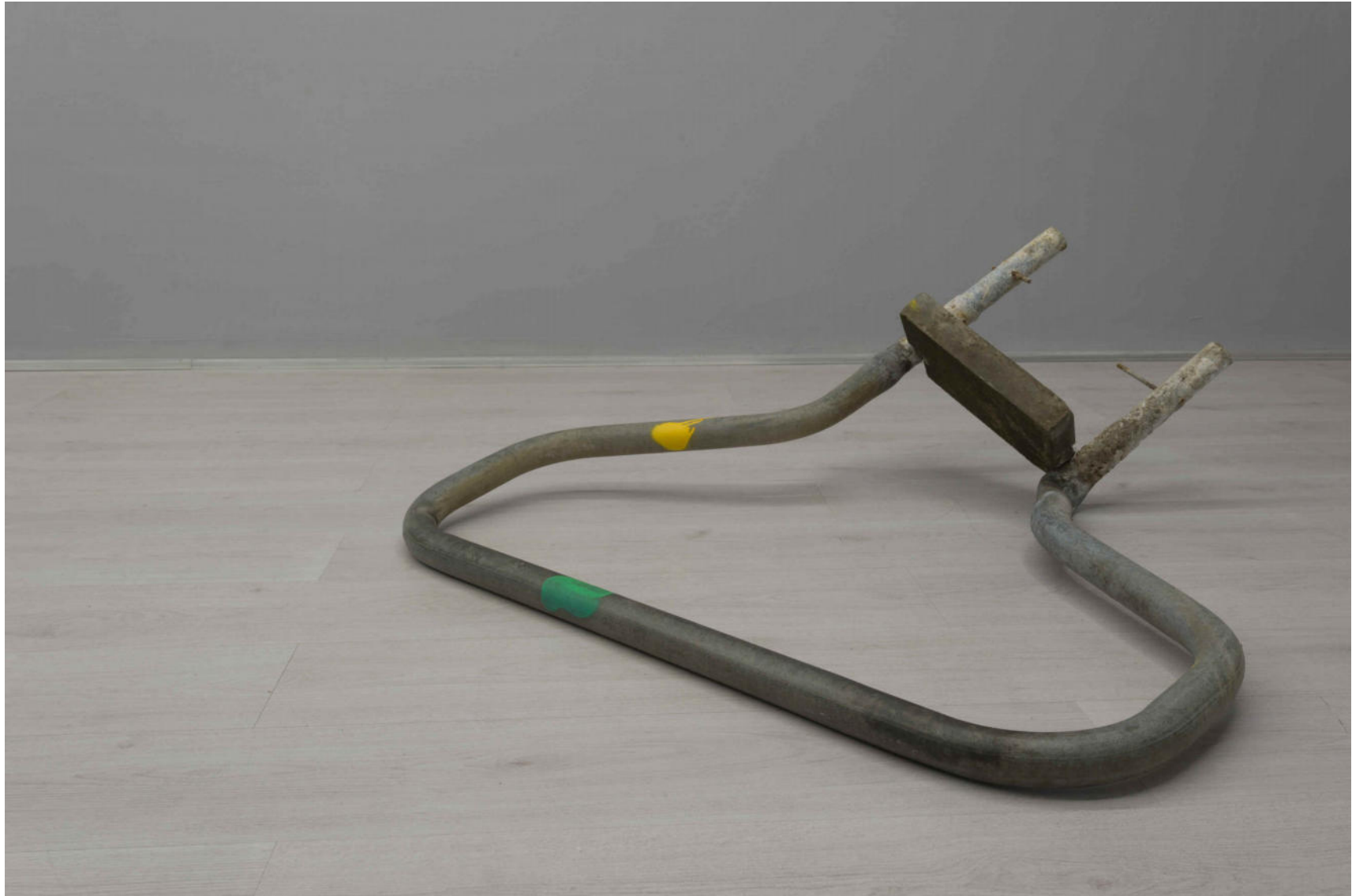
Memory Lane, from the series of the objet trouveé, 2015