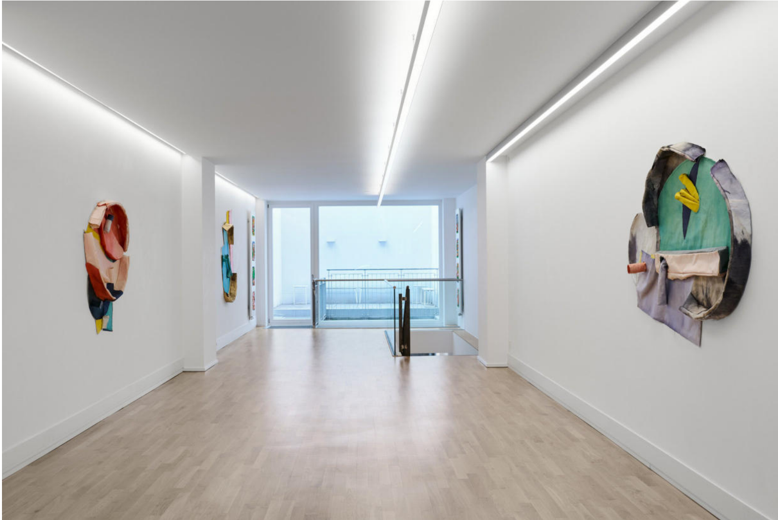
Fontaines, Galerie Alber, Cologne, 2021