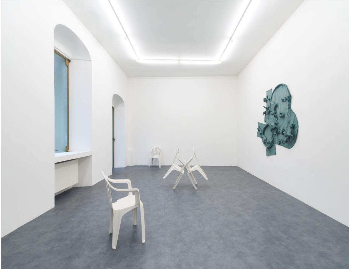
Sunbathing in the mud, A+B Gallery, Brescia, 2021