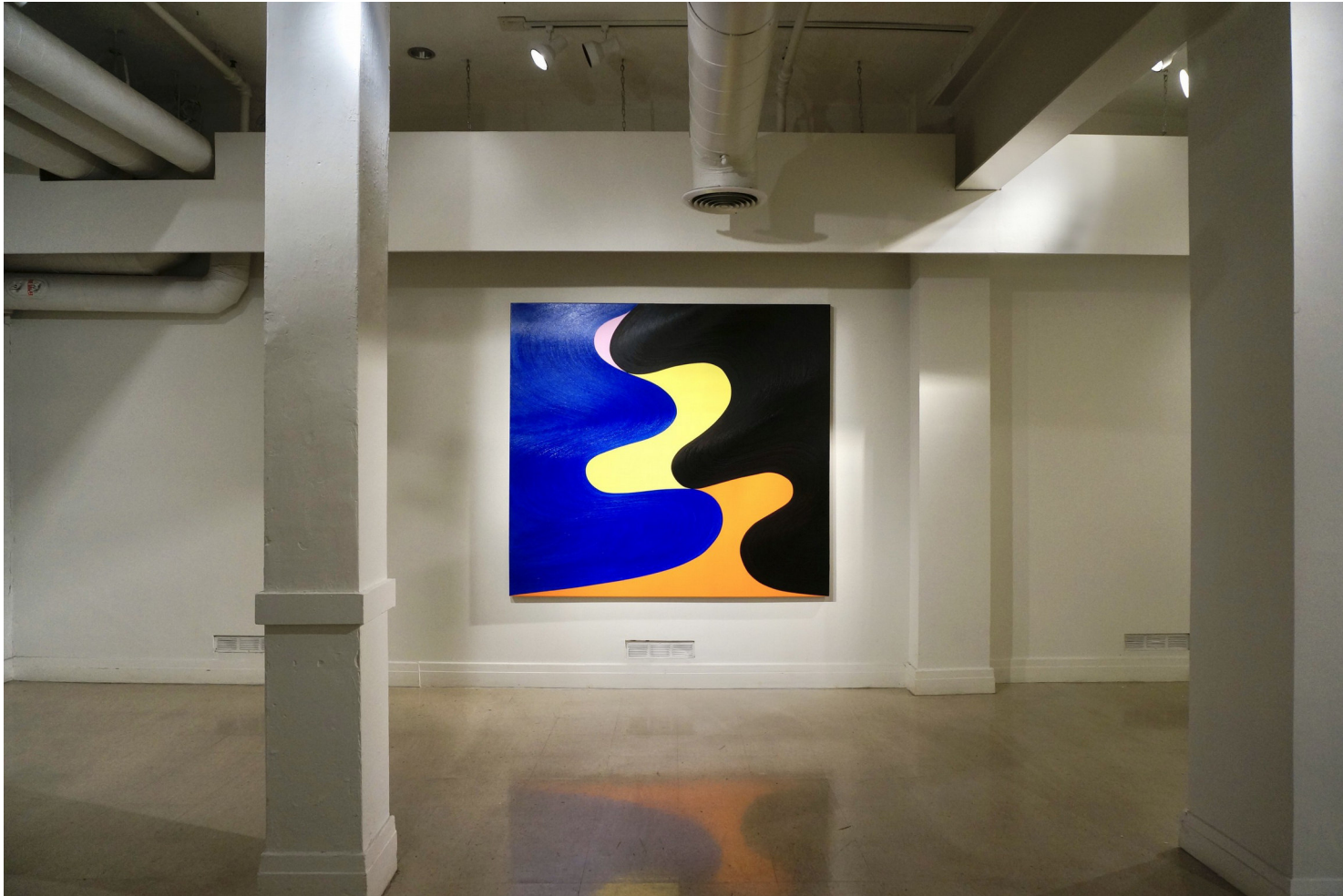
Hand in Hand, LA Artcore, Los Angeles, 2021