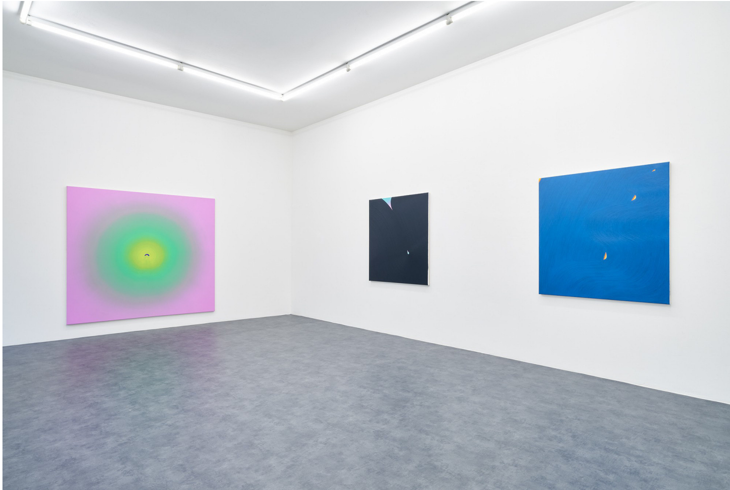
Floating Head, A+B Gallery, Brescia, 2020