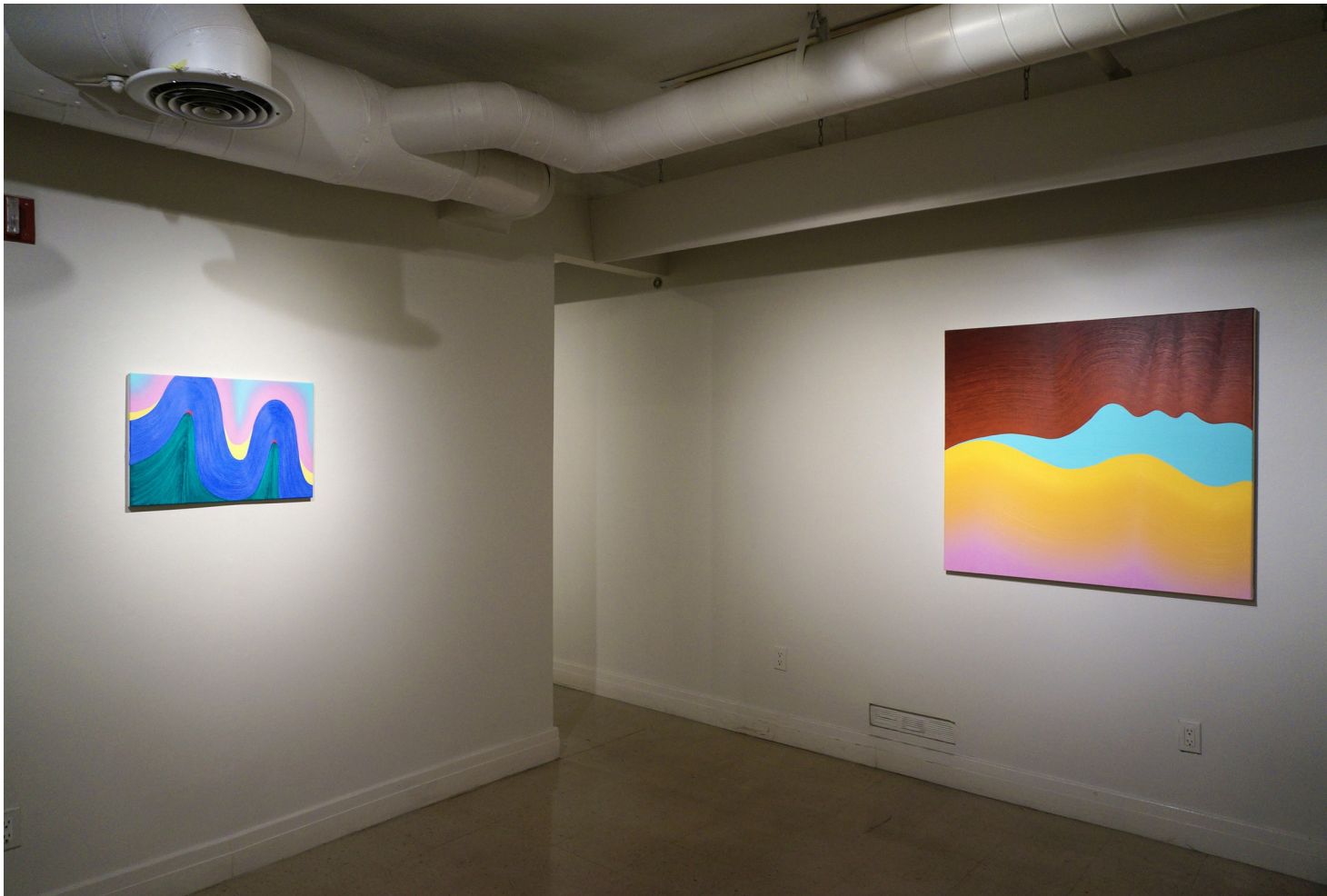
Hand in Hand, LA Artcore, Los Angeles, 2021