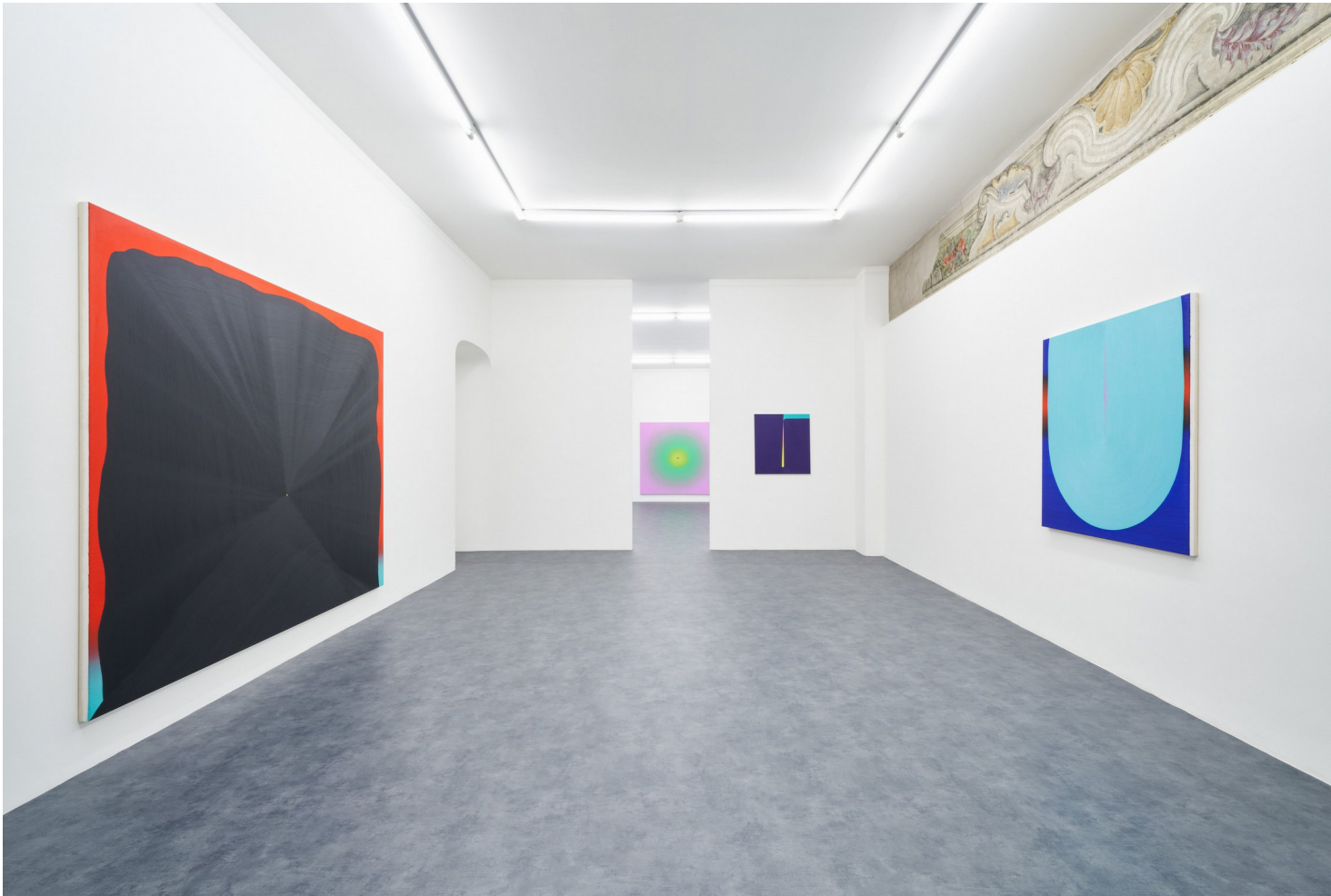
Floating Head, A+B Gallery, Brescia, 2020