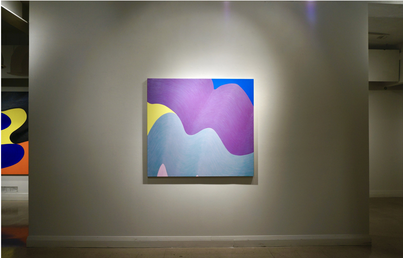
Hand in Hand, LA Artcore, Los Angeles, 2021