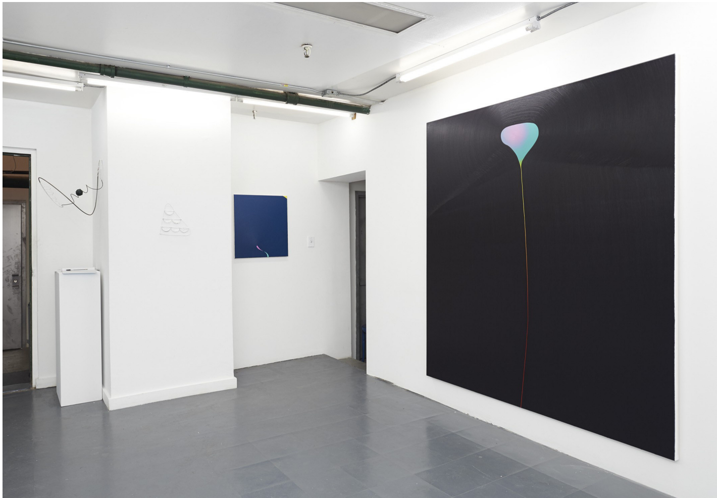
These seeds breath, duo show with Elisa Lendvai at Underdonk, Brooklyn, 2019