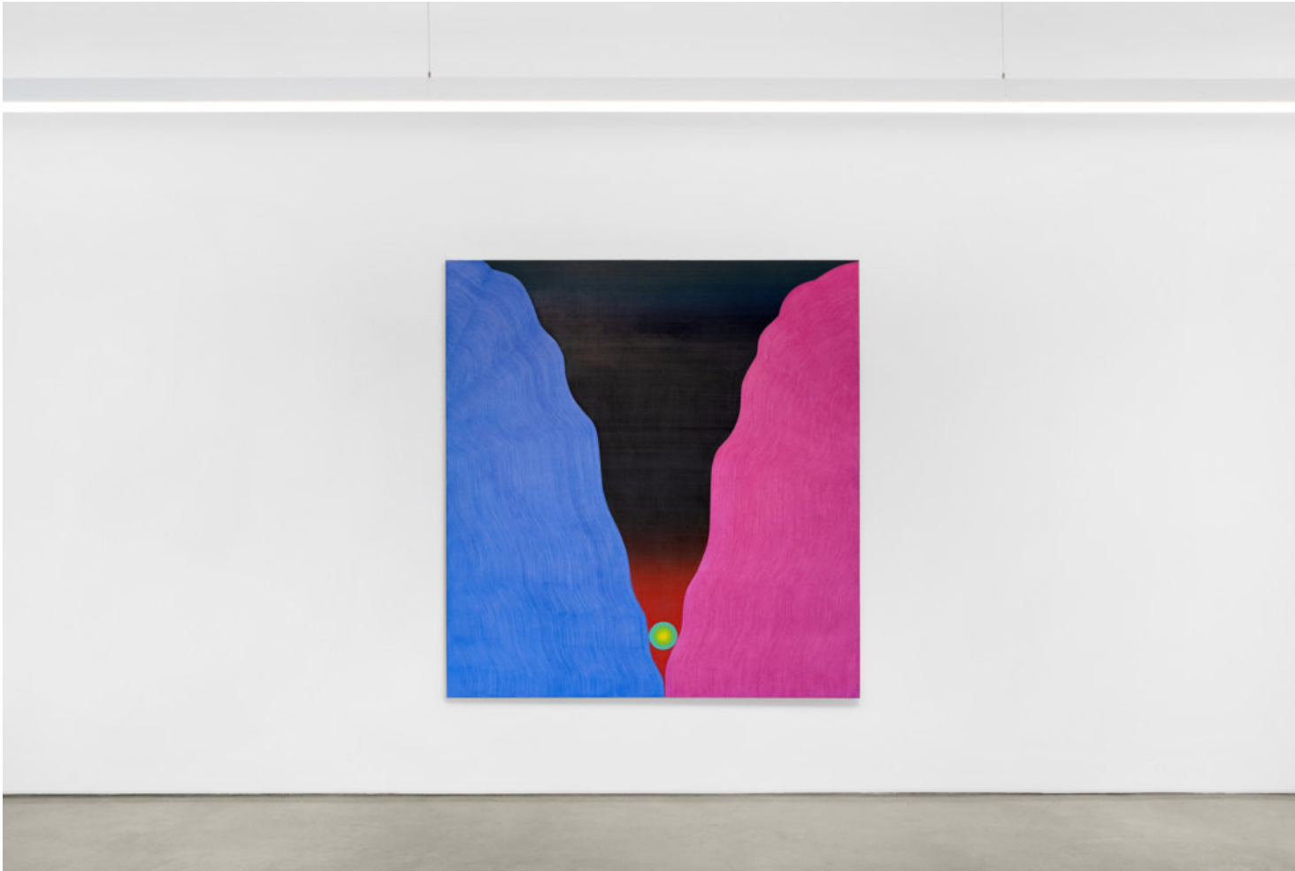
Foreign Relations, Mindy Solomon Gallery, 2023