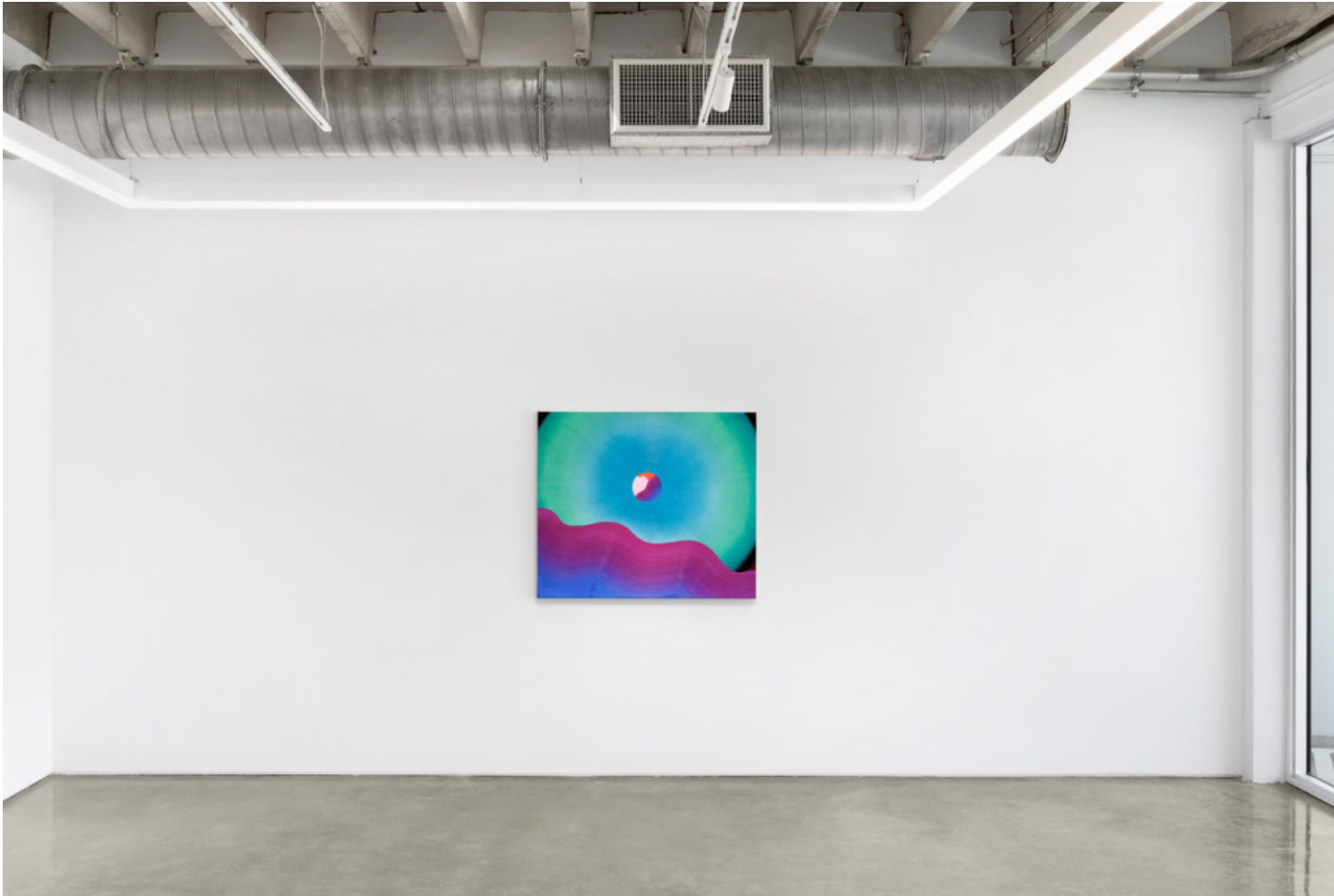
Foreign Relations, Mindy Solomon Gallery, 2023