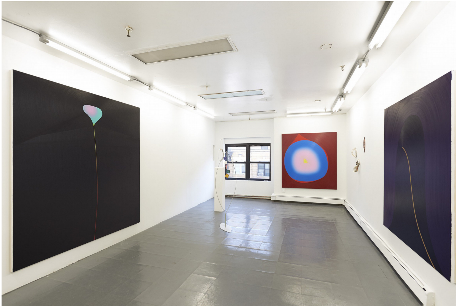
These seeds breath, duo show with Elisa Lendvay at Underdonk, Brooklyn, 2019