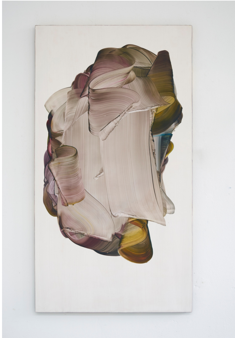
Markus Saile Untitled, 2023 Oil on wood 123x67 cm