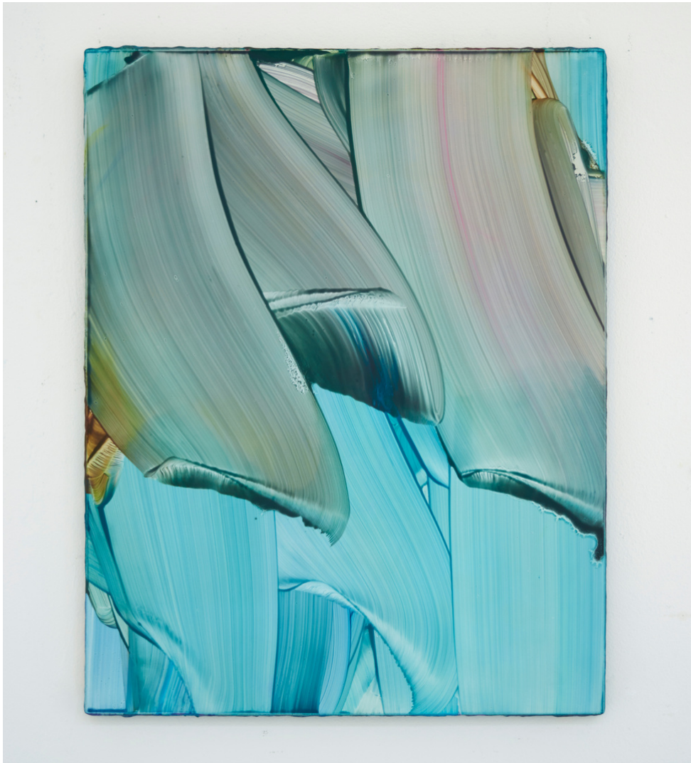
Markus Saile Untitled, 2023 Oil on wood 59x46 cm