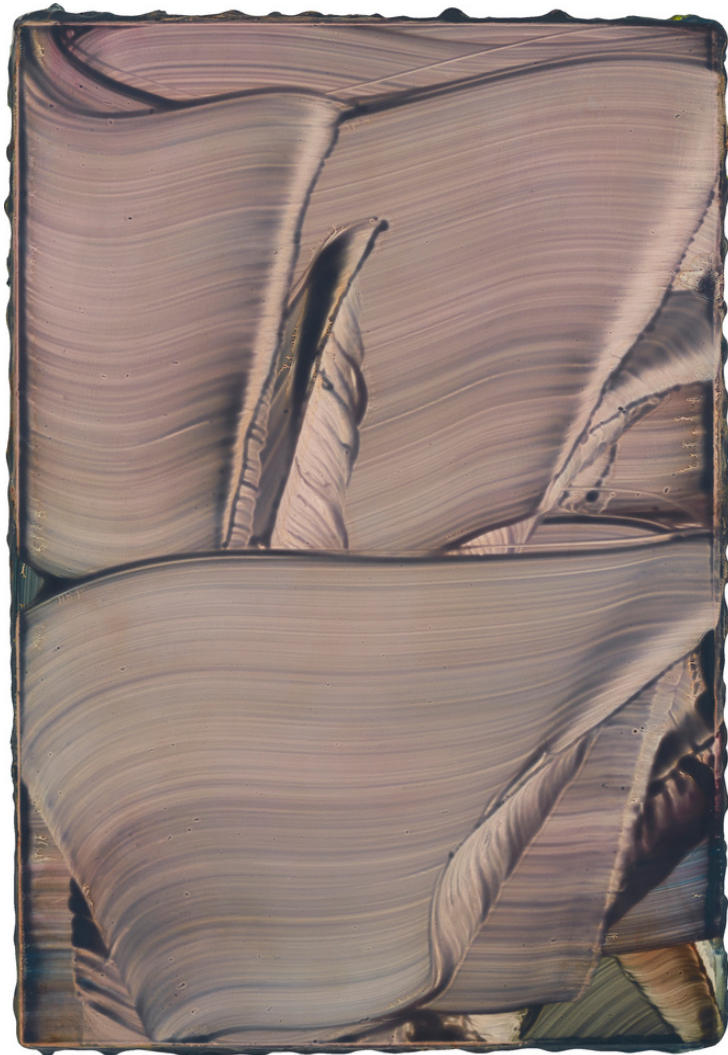
Markus Saile Untitled, 2023 Oil on wood 28,4x19,5 cm