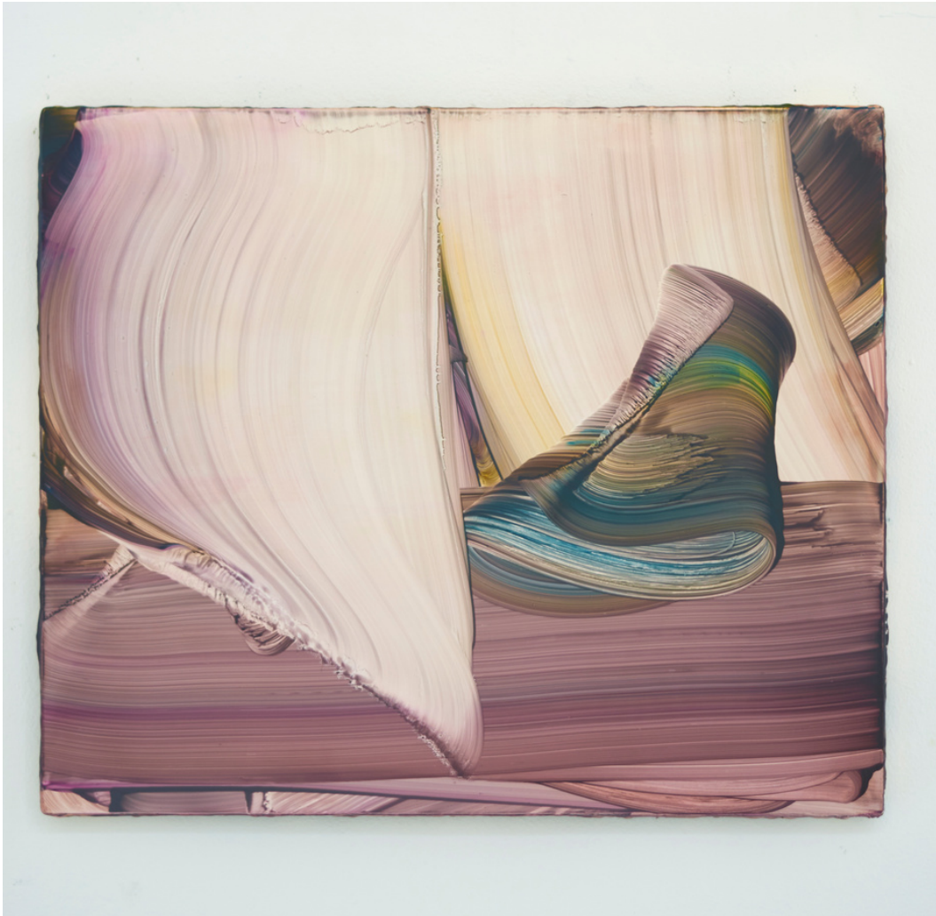
Markus Saile Untitled, 2023 Oil on wood 41x49 cm