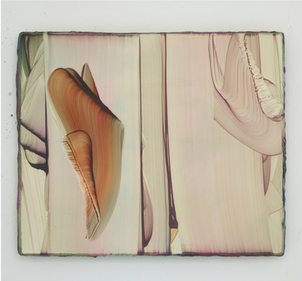
Markus Saile Untitled, 2023 Oil on wood 31,5x37,5 cm