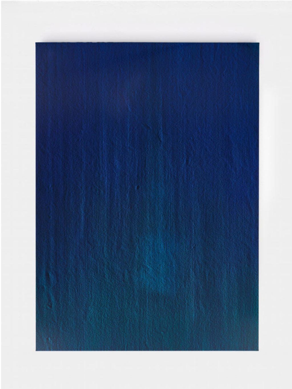
Hermann Bergamelli, Lentasia, 2023 oil-based color impasto worked on canvas, 180x130 cm, Euro 6500 VAT incl.