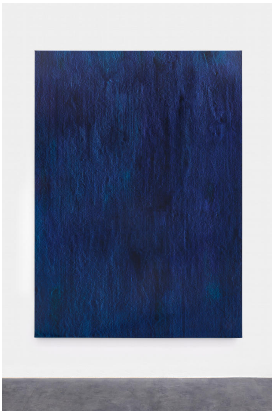
Hermann Bergamelli, Tempo al tempo, 2022 oil-based color impasto worked on canvas, 180x130 cm, Euro 6500 VAT incl.