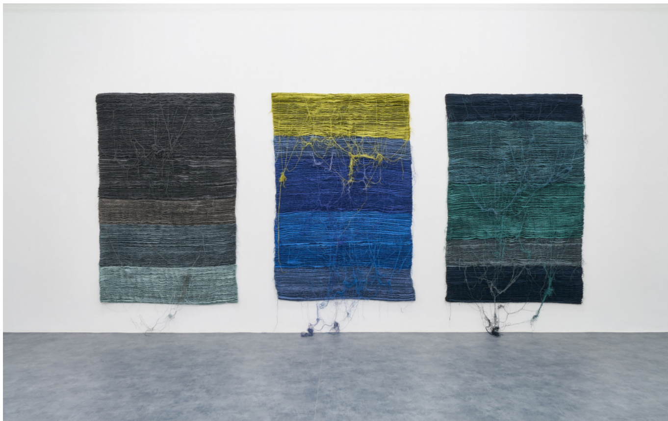
Electro Glide in Blue Hermann Bergamelli A+B Gallery solo show, 2020