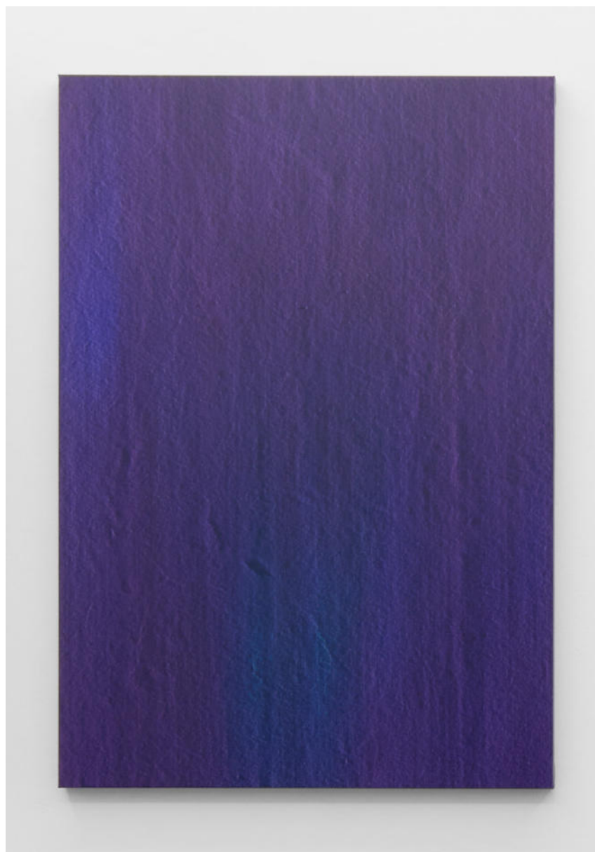
Hermann Bergamelli, Fuga dalla cava, 2023 oil-based color impasto worked on canvas, 130x90 cm, Euro 4500 VAT incl.