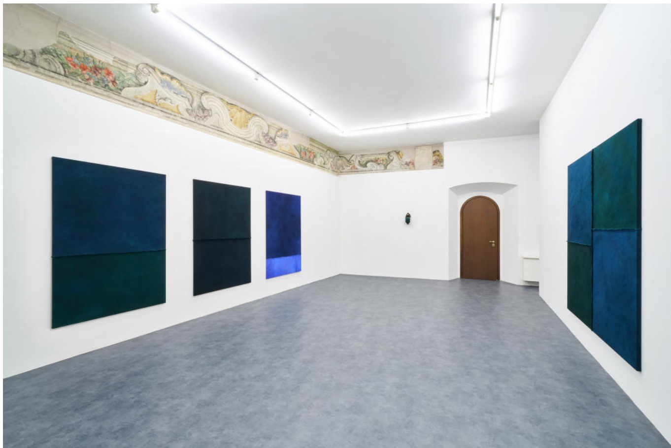
Electro Glide in Blue Hermann Bergamelli A+B Gallery solo show, 2020