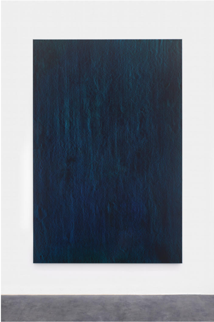
Hermann Bergamelli, Lo scoglio, 2022 oil-based color impasto worked on canvas, 180x120 cm, Euro 6500 VAT incl.