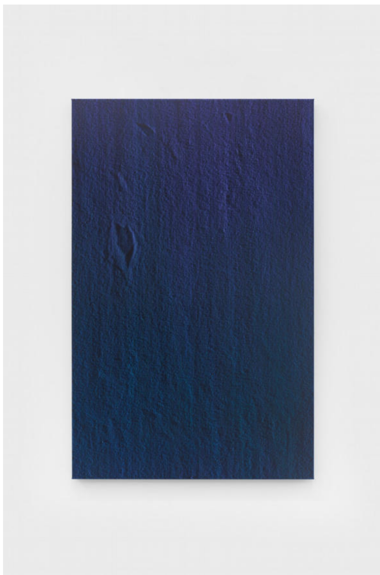
Hermann Bergamelli, Flok, 2022 oil-based color impasto worked on canvas, 110x90 cm Euro 4000 VAT incl.