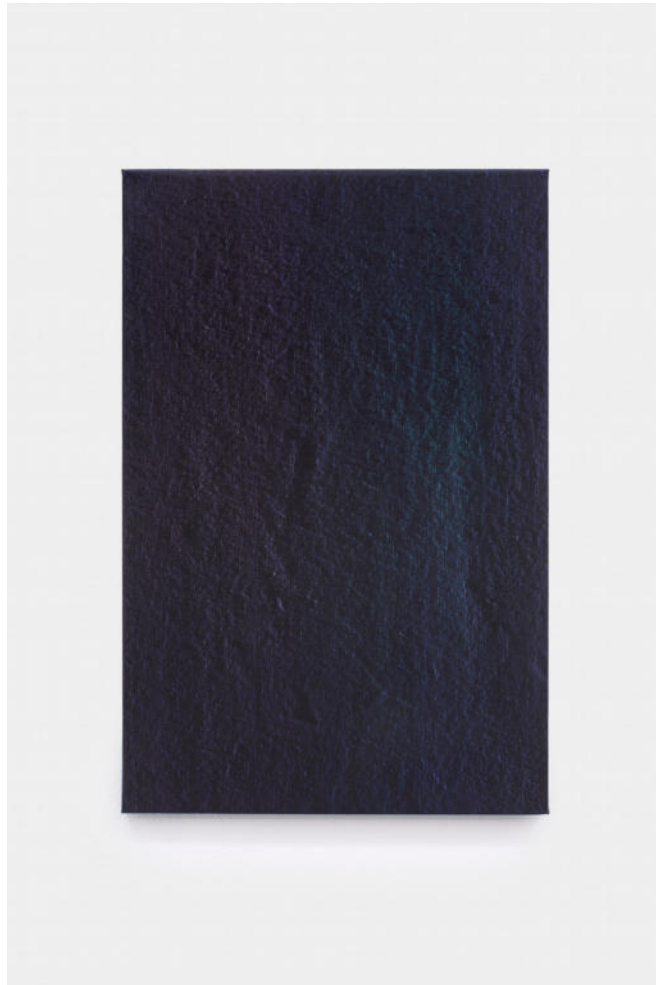
Hermann Bergamelli, Ventosa, 2023 oil-based color impasto worked on canvas, 60x40 cm Euro 2500 VAT incl.