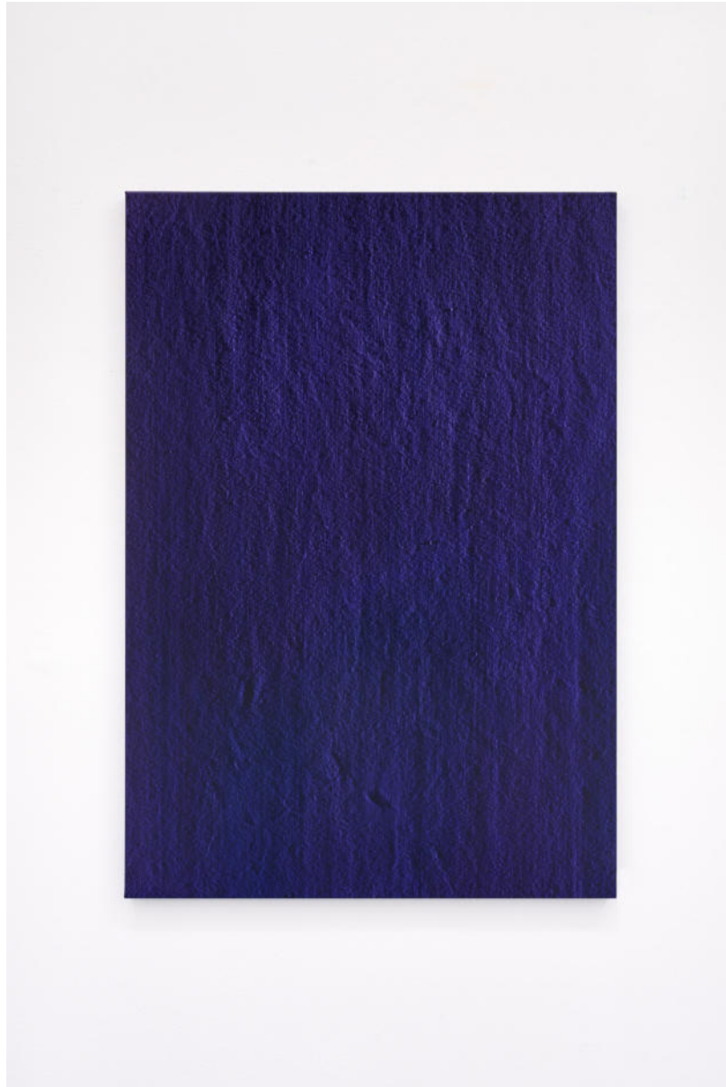
Hermann Bergamelli, I maghi, 2023 oil-based color impasto worked on canvas, 130x90 cm, Euro 4500 VAT incl.