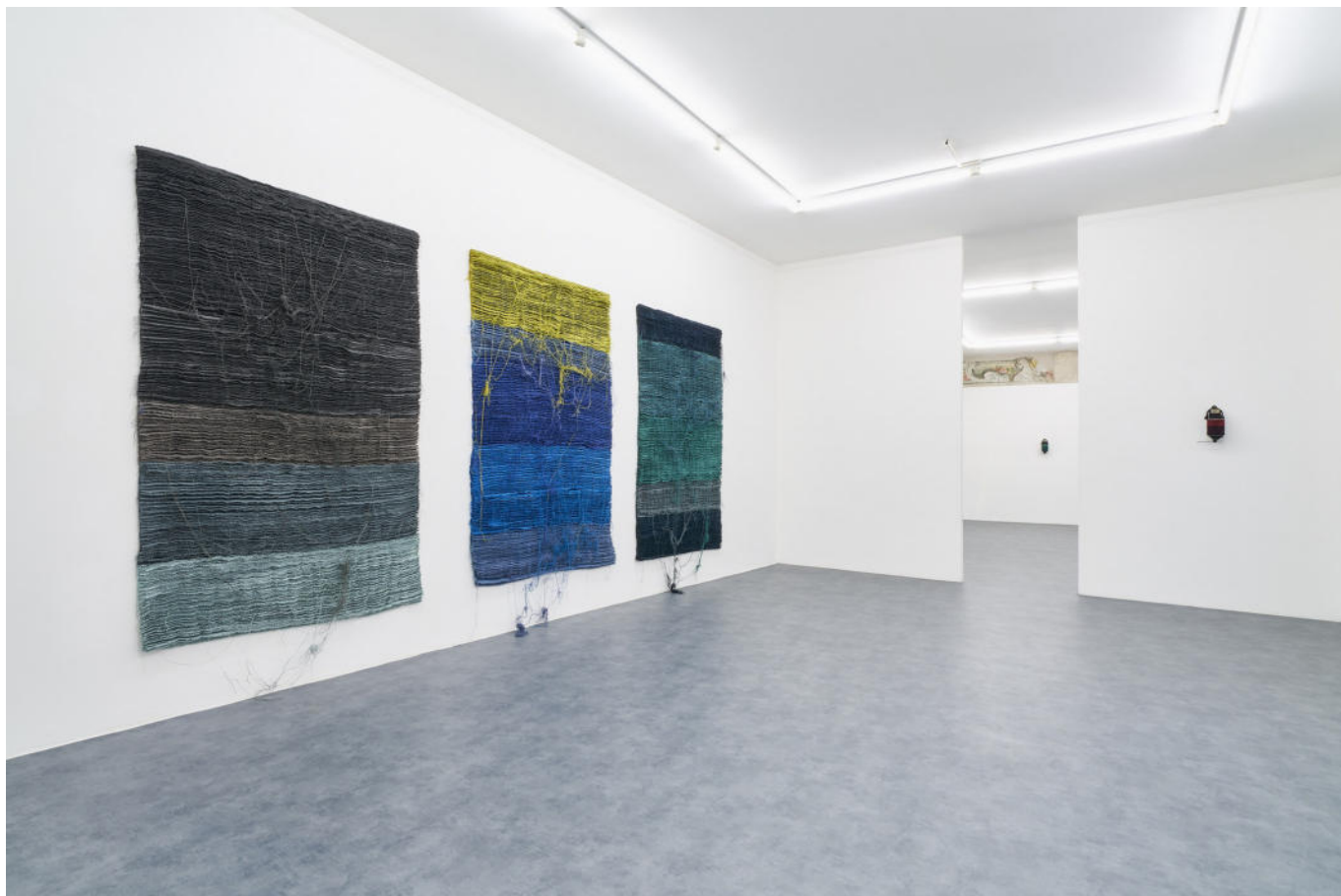
Electro Glide in Blue Hermann Bergamelli A+B Gallery solo show, 2020