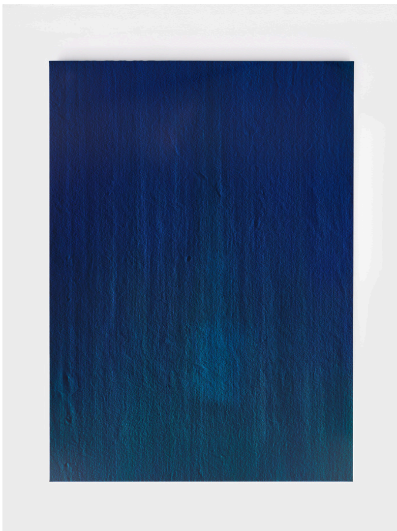
Hermann Bergamelli Lamalalama, 2022 Impasto based oil paint worked on canvas 180x130 cm detail