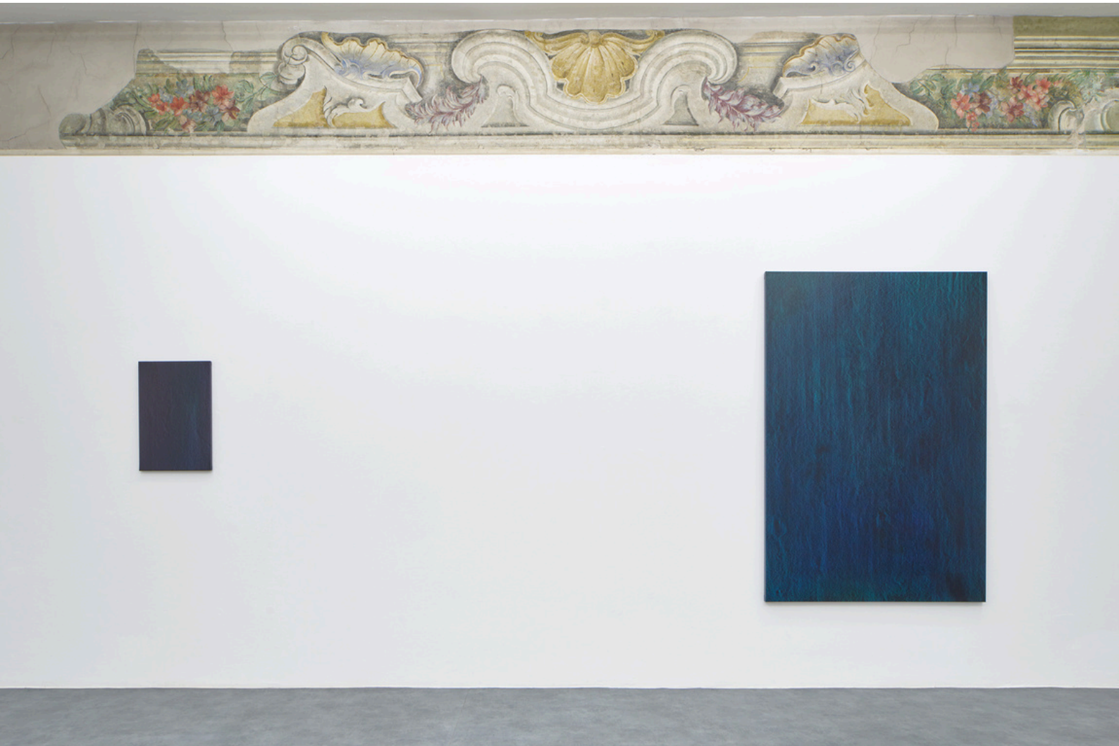
Hermann Bergamelli Lamalalama, 2022 Impasto based oil paint worked on canvas 180x130 cm