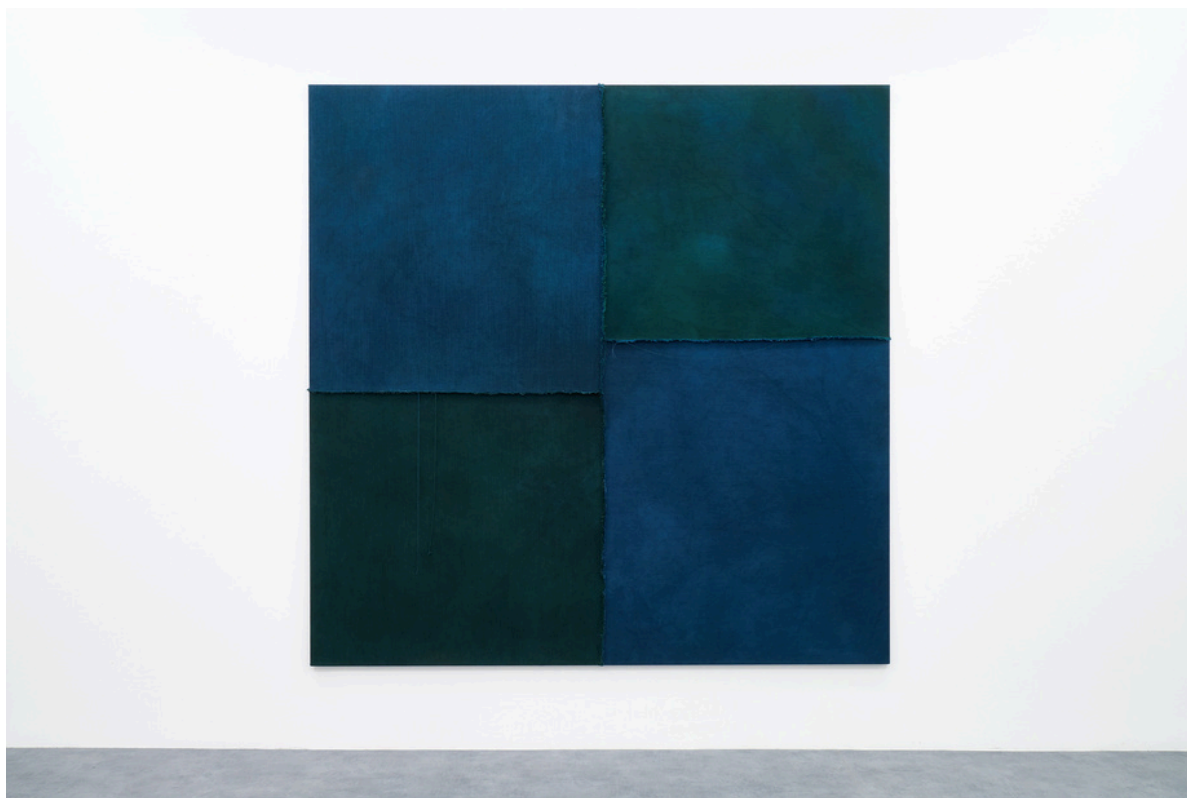
Hermann Bergamelli Verde nel verde blu, 2020 Dyeing with natural and chemical elements on fabric, stitching 200x200cm