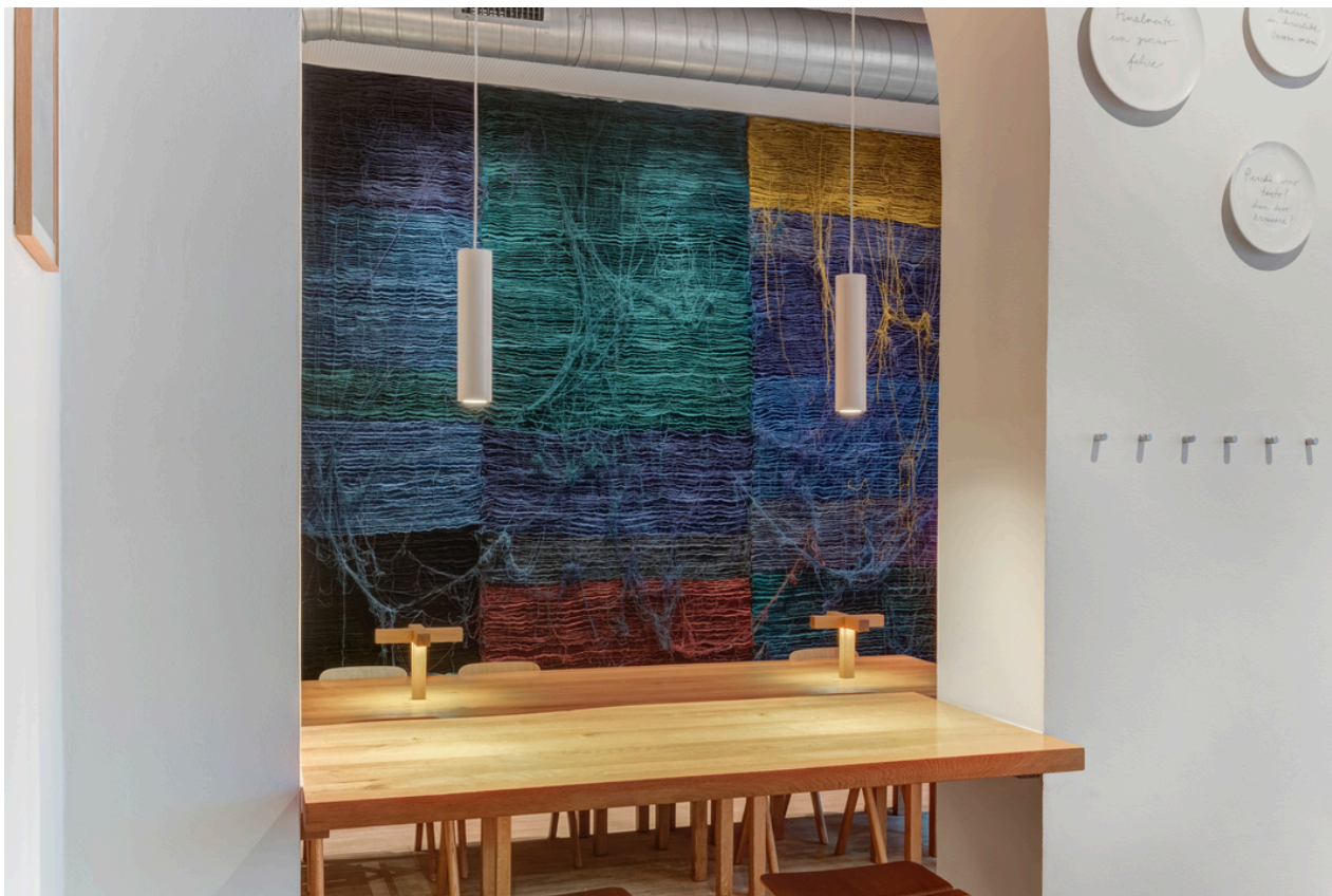
Hermann Bergamelli Installation Zazà ramen sake bar & restaurant, 2020