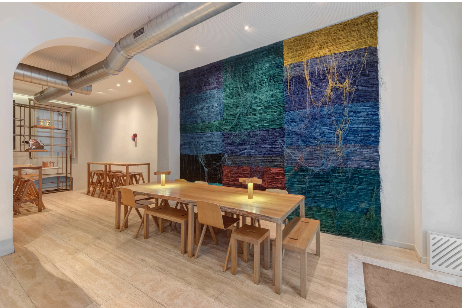
Hermann Bergamelli Installation Zazà ramen sake bar & restaurant, 2020