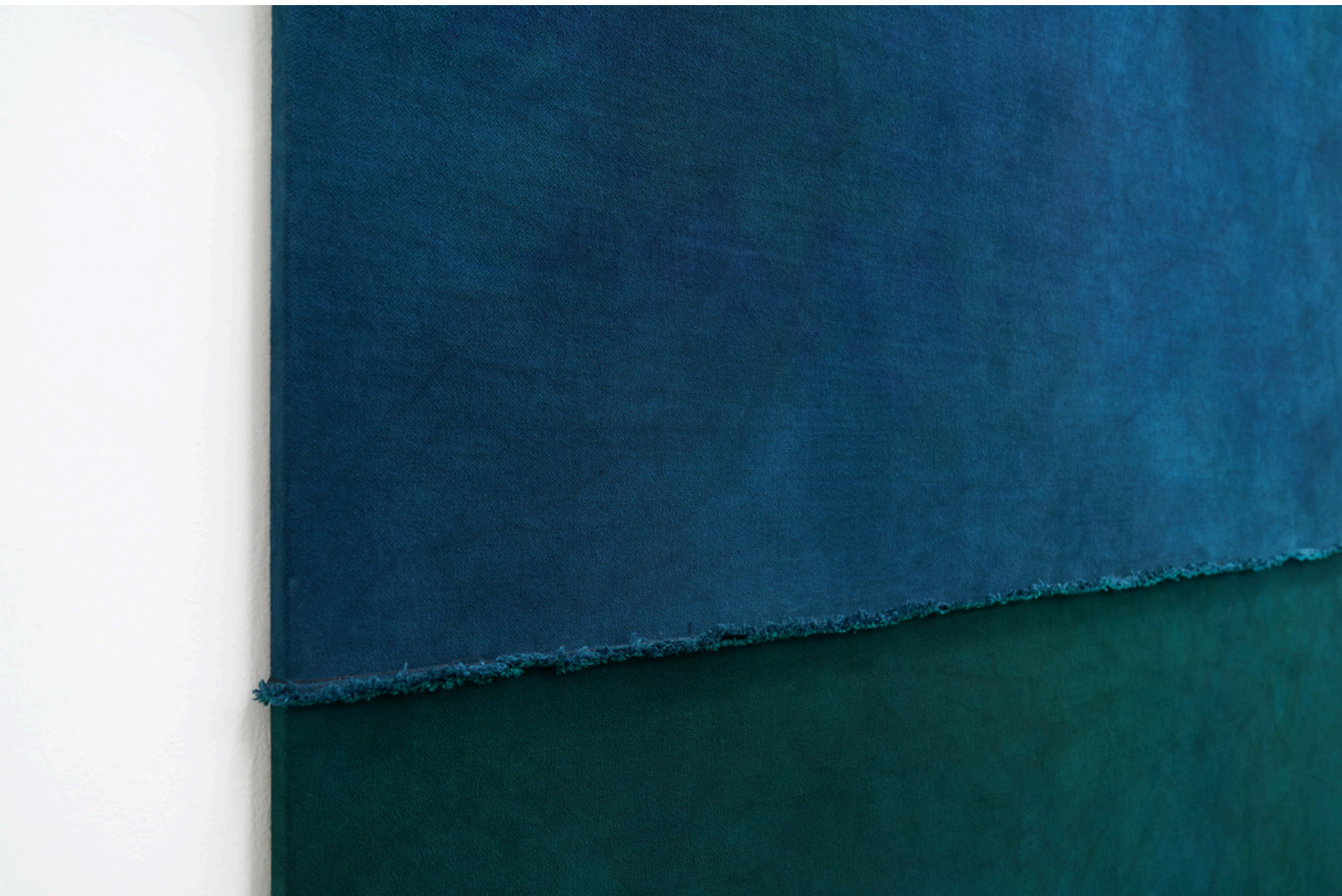
Hermann Bergamelli Verde nel verde blu, 2020 Dyeing with natural and chemical elements on fabric, stitching 200x200cm detail