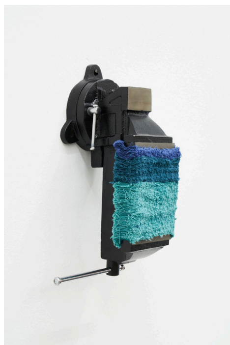
Hermann Bergamelli Untitled, 2020 Dyeing with natural and chemical elements on fabric 35x15x20 cm