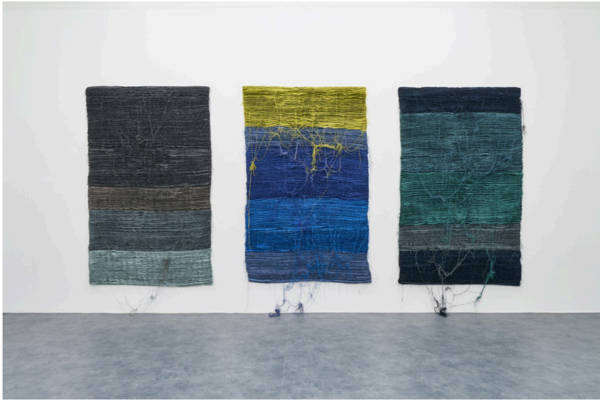
Electro Glide in Blue Hermann Bergamelli A+B Gallery solo show, 2020