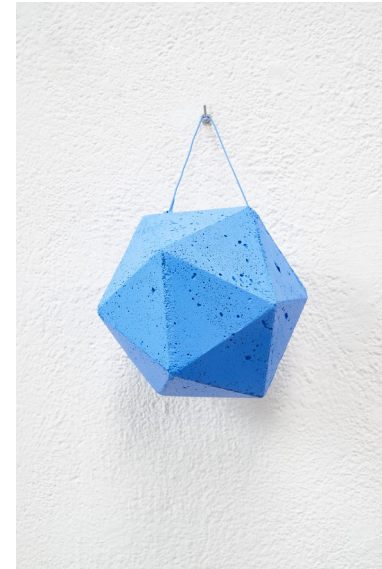
Marco La Rosa, il mio doloroso ritorno voglio narrarti (Pèlagos) concrete, pigments, steel, 30x25x19 Euro 2500 vat incl