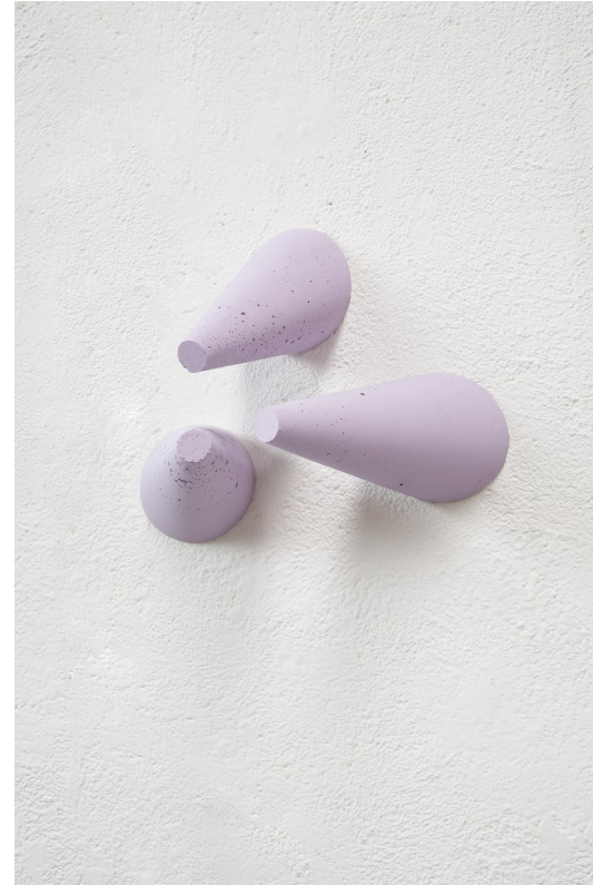
Marco La Rosa, Passa oltre (Pèlagos) concrete, pigments, 26x40x40cm euro 3500 vat incl