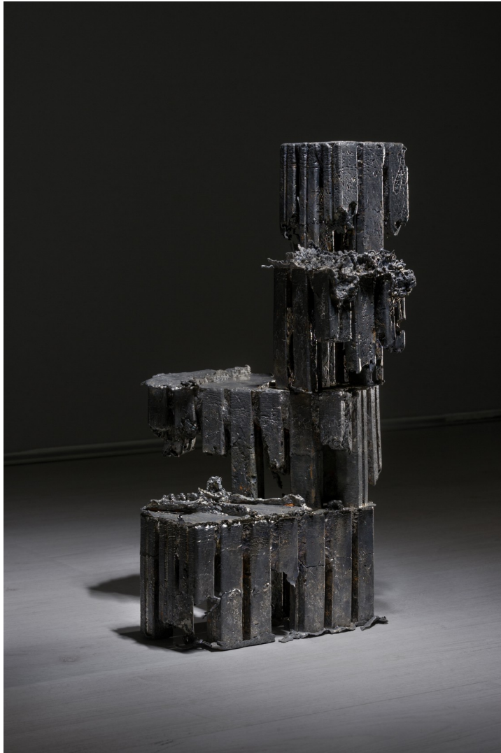
Marco La Rosa, Apoteosi n.5, lead, 47x26x26 cm Euro 3500 vat incl