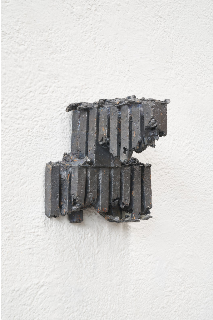
Marco La Rosa, Apoteosi n. 17, 2016 lead, 20,5x20x19 cm euro 1800 vat incl