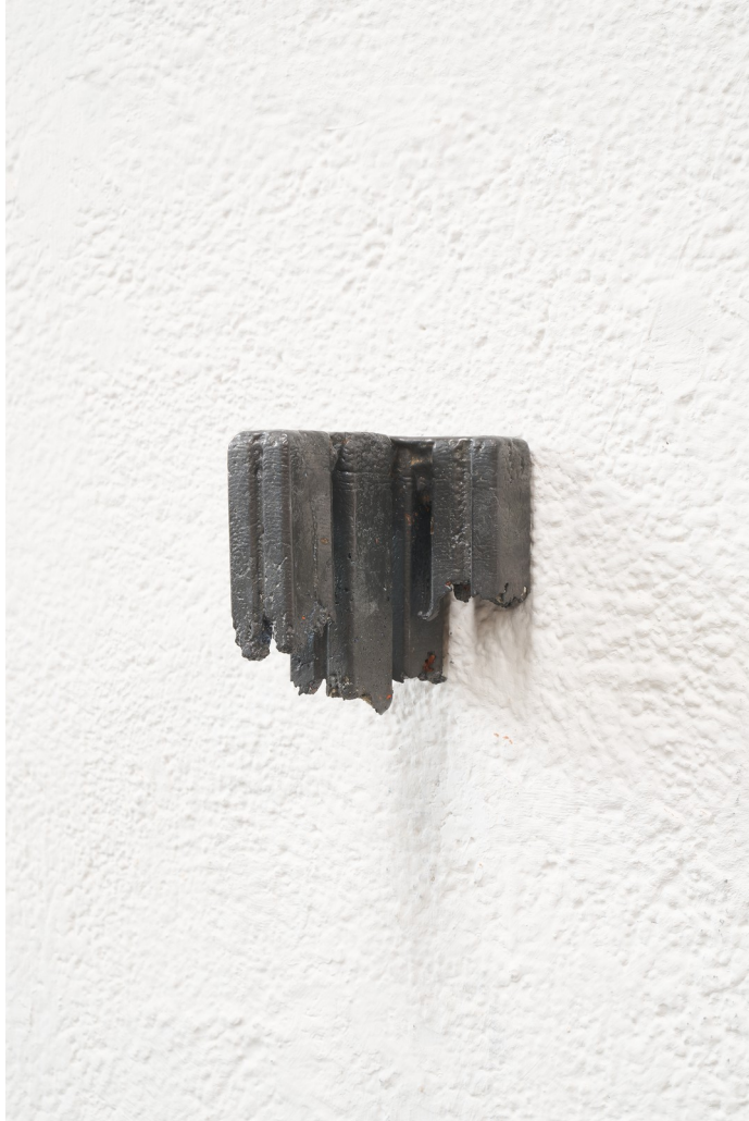
Marco La Rosa, Complessa semplicità, 2014 lead, 6x9x9 cm Euro 1200 vat incl