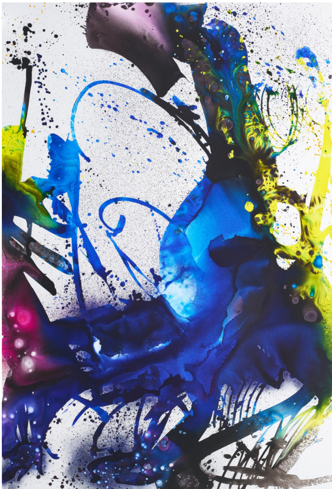
Max Frintrop, MaxMax, 2022, mixed media on canvas, 300x250 cm Euro 28000 VAT incl.