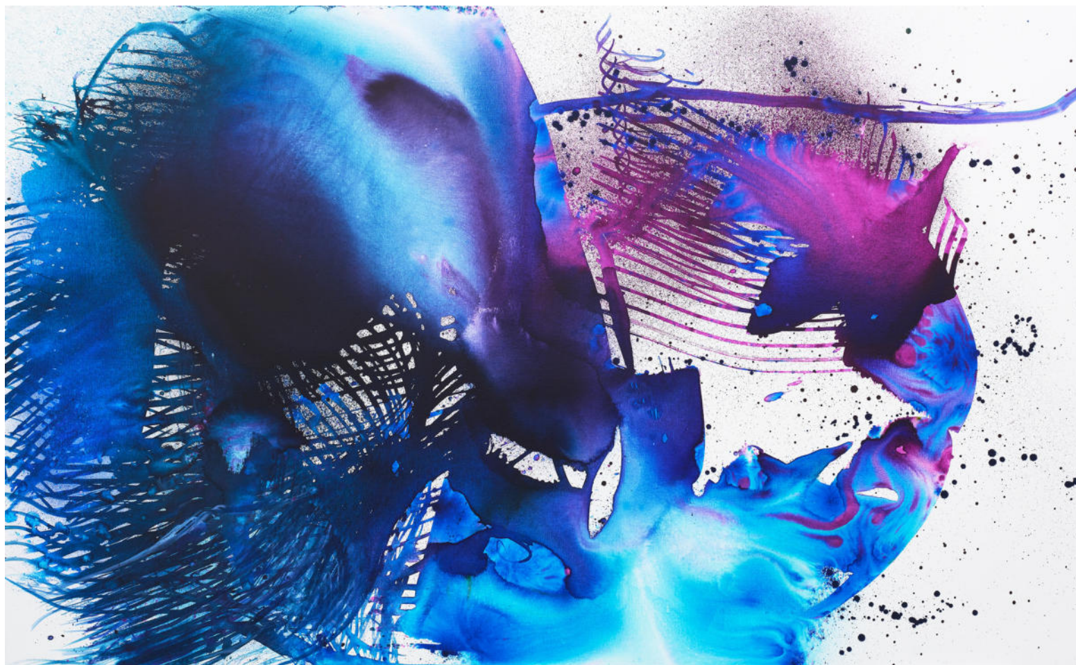
Max Frintrop, Untitled, 2022 mixed media on canvas, 160x260 cm Euro 23000 VAT incl.