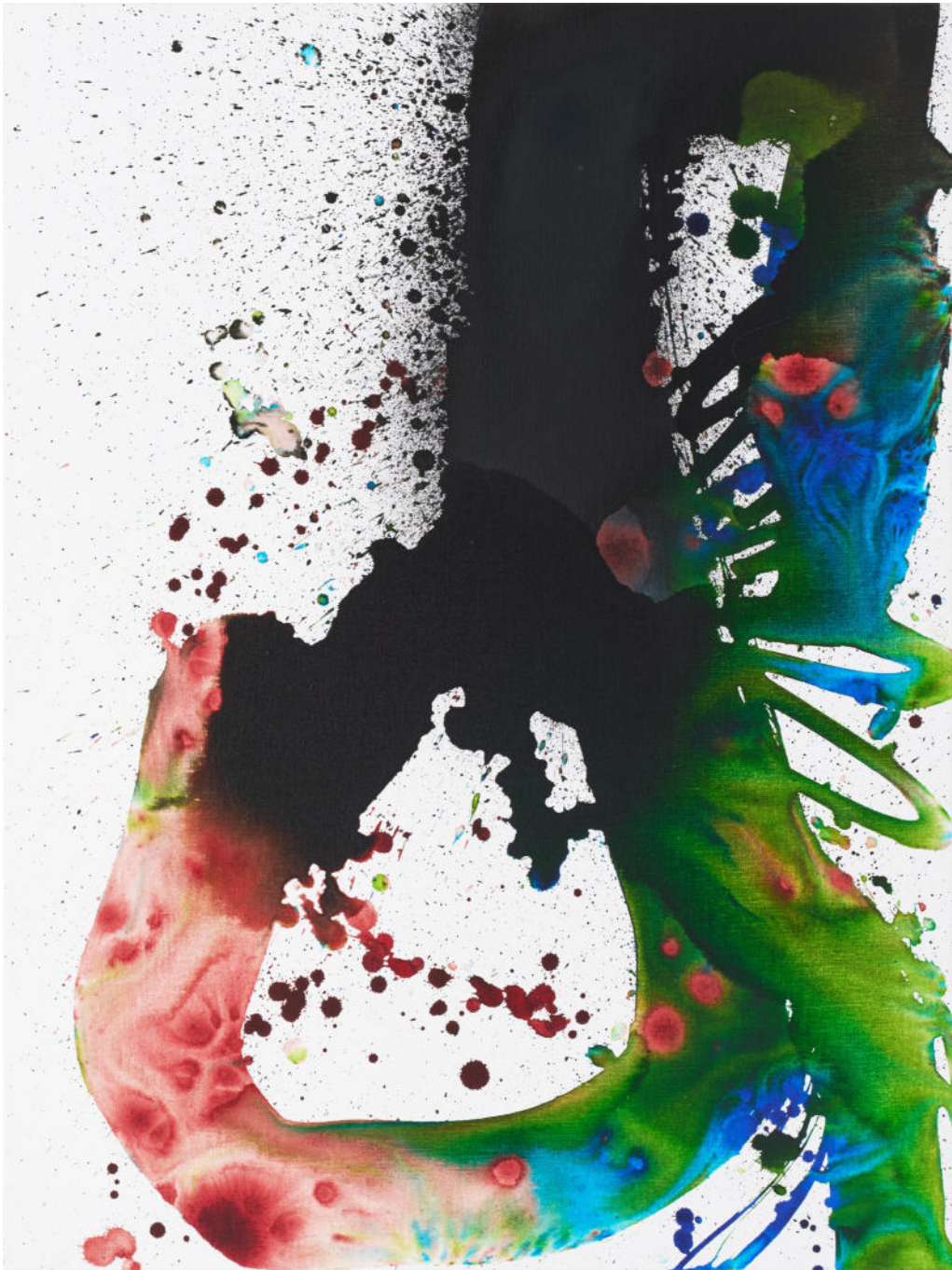
Max Frintrop, Untitled, 2022 mixed media on canvas, 100x75 cm Euro 9500 VAT incl.