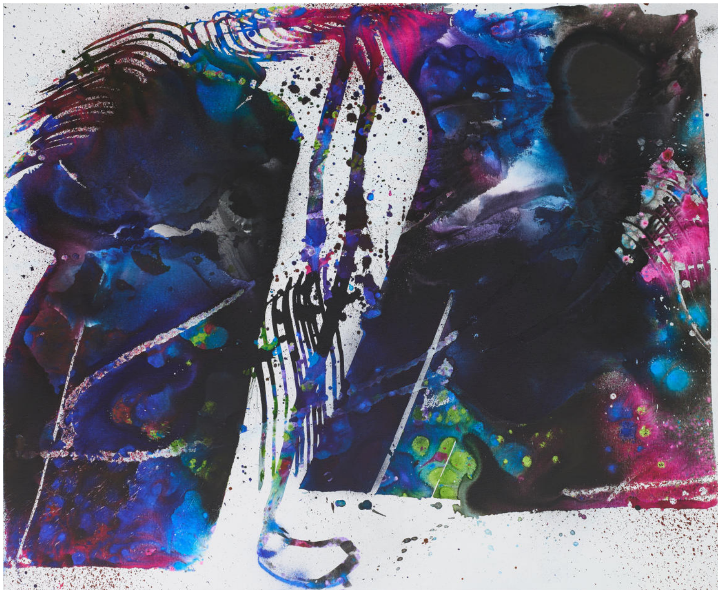
Max Frintrop, Untitled, 2022 mixed media on canvas, 200x180 cm Euro 22000 VAT incl.