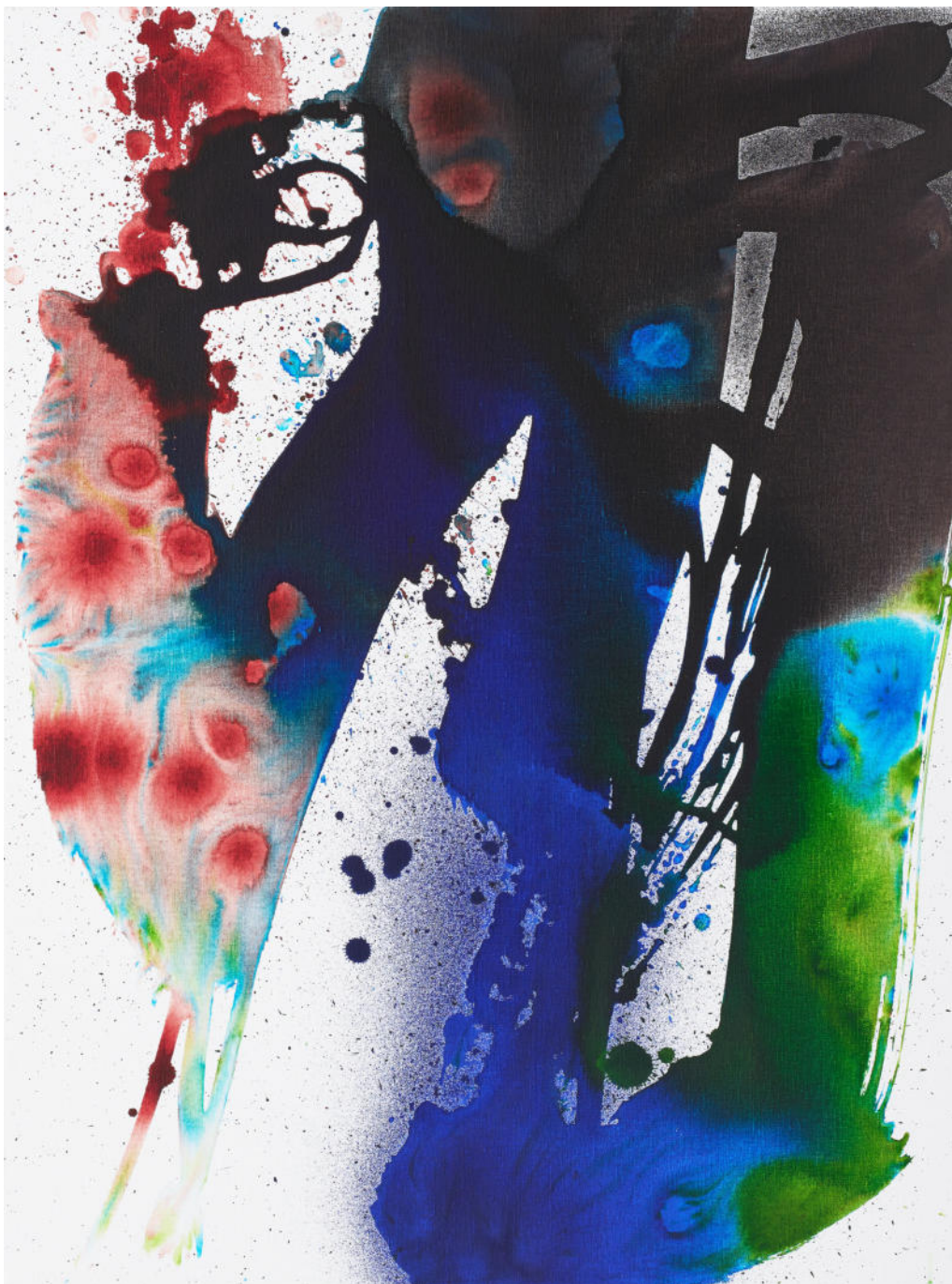
Max Frintrop, Untitled, 2022 mixed media on canvas, 100x75 cm Euro 9500 VAT incl.