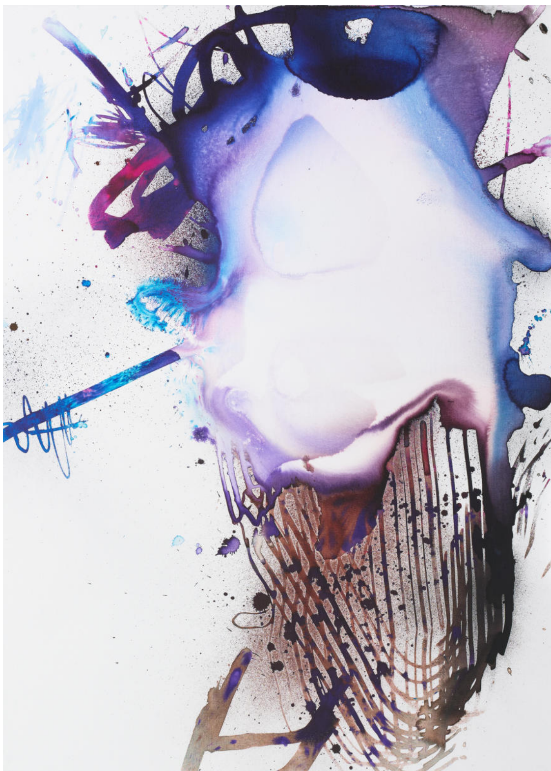
Max Frintrop, Untitled, 2022 mixed media on canvas, 180x140 cm Euro 17500 VAT incl.