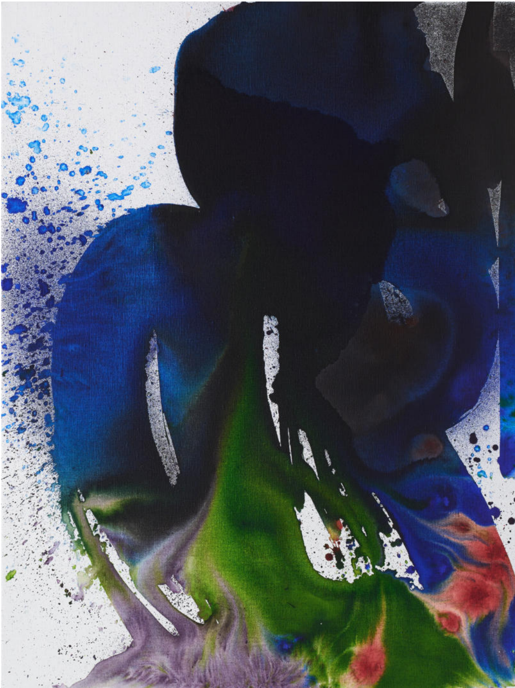
Max Frintrop, Untitled, 2022 mixed media on canvas, 100x75 cm Euro 9500 VAT incl.