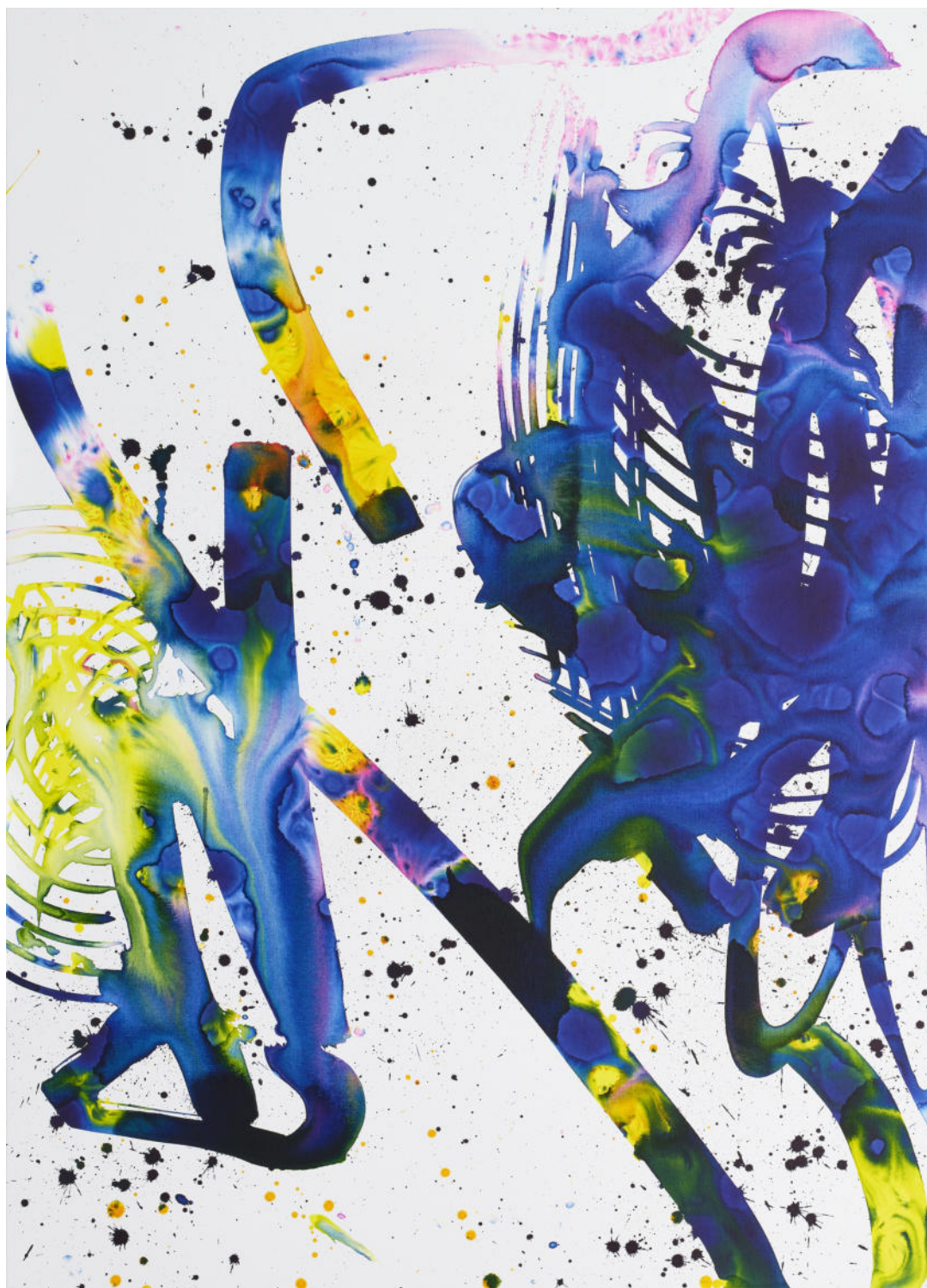
Max Frintrop, Untitled, 2022 mixed media on canvas, 180x140 cm Euro 17500 VAT incl.