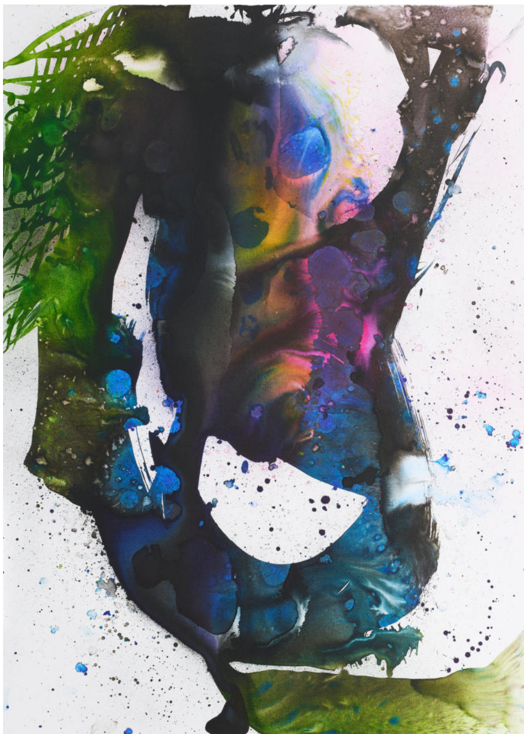
Max Frintrop, Untitled, 2022 mixed media on canvas, 180x140 cm Euro 17500 VAT incl.