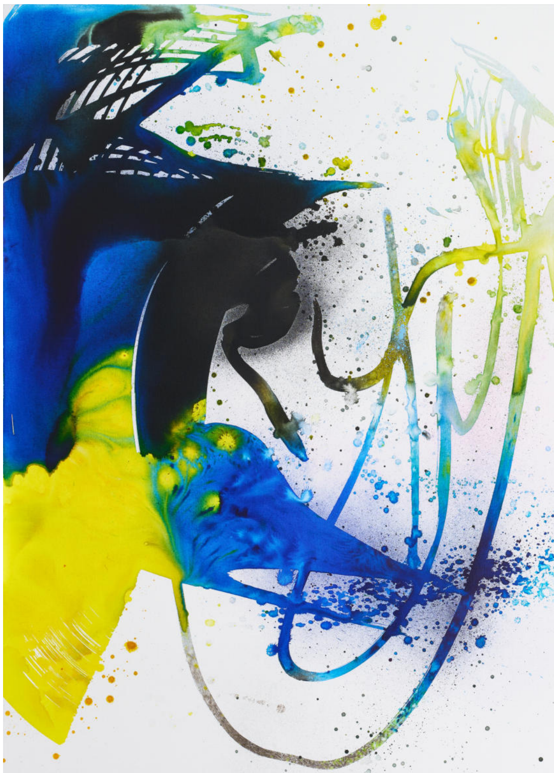
Max Frintrop, Untitled, 2022 mixed media on canvas, 180x140 cm Euro 17500 VAT incl.