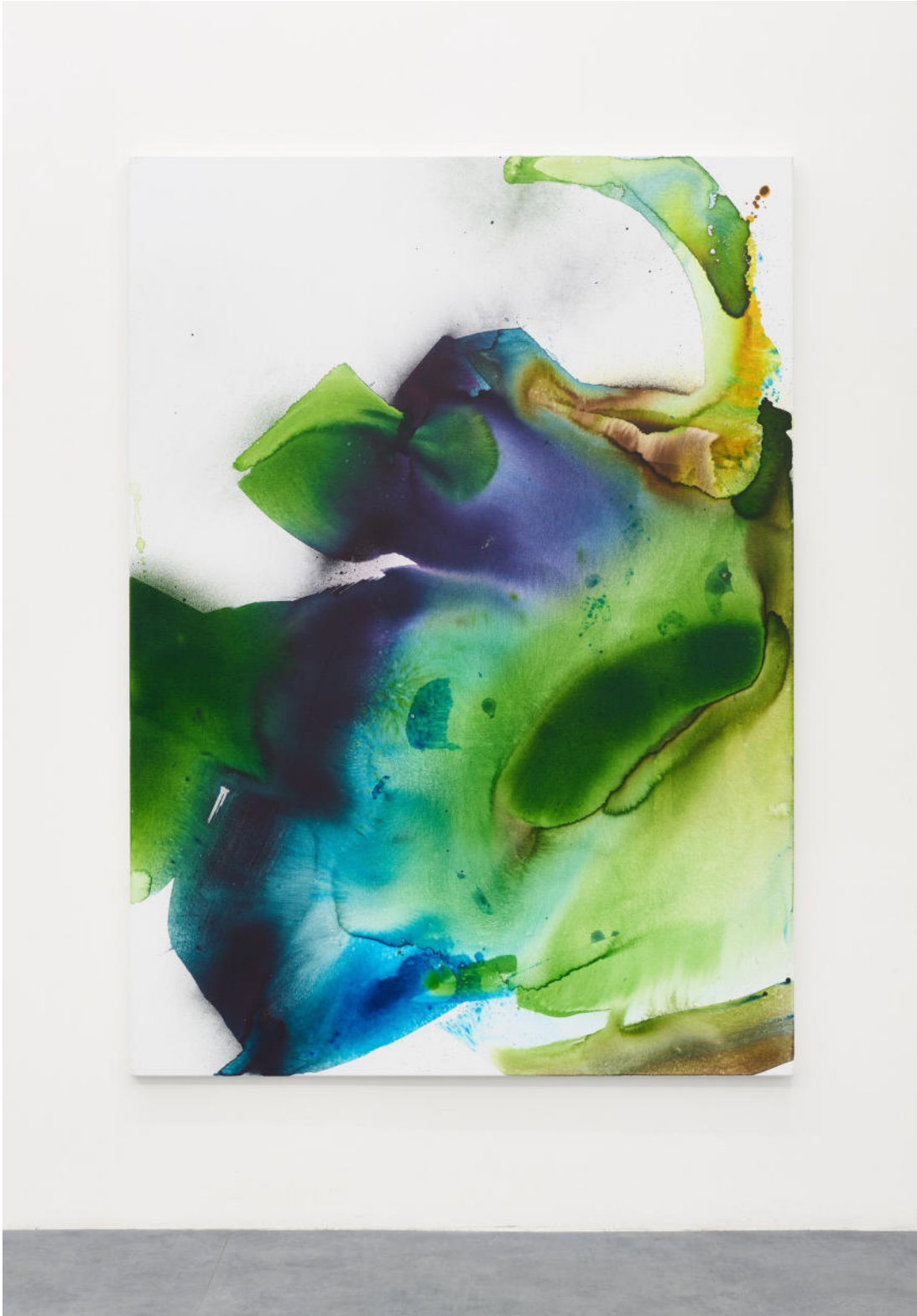
Max Frintrop, Riptide, 2021 acrylics on canvas, 180x130cm Euro 17000 VAT incl.