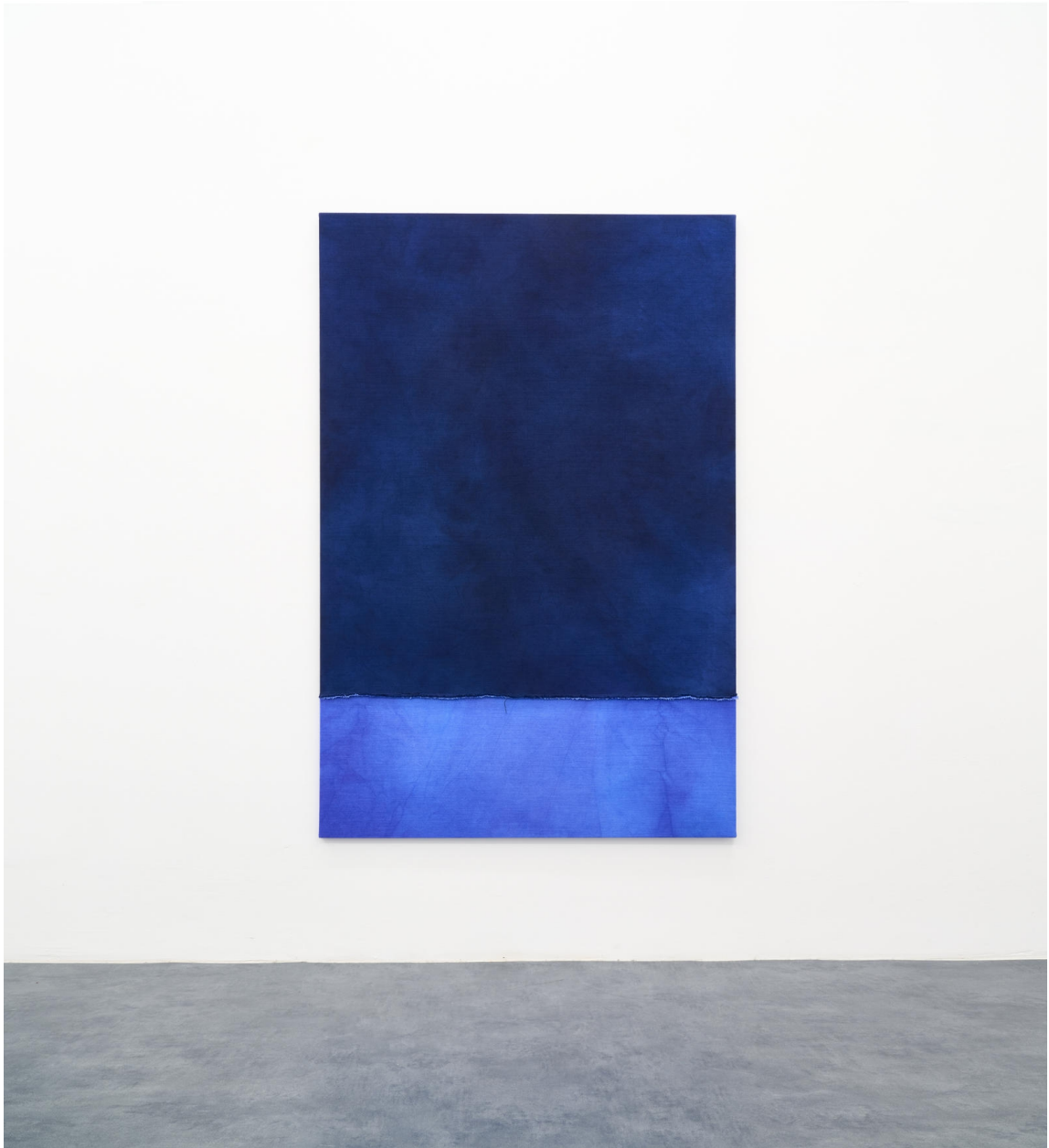
Hermann Bergamelli Blu blu Dyeing with natural and chemical elements on fabric, stitching 180 x 120 cm 2020 Euro 4000