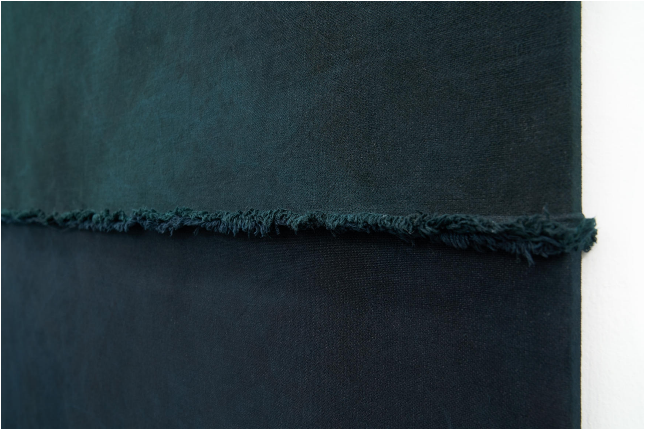
Hermann Bergamelli, Verde in verde verde Dyeing with natural and chemical elements on fabric, stitching 180 x 120 cm, 2020 Euro 4000 (Detail)