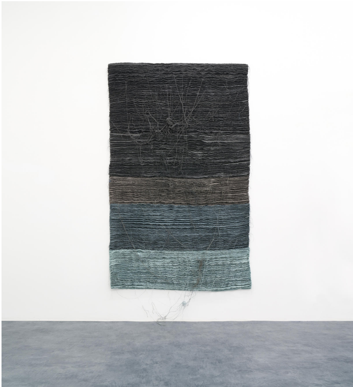
Hermann Bergamelli Grigio su grigio Dyeing with natural and chemical elements on fabric, stitching 240 x 140 cm 2020 Euro 4900