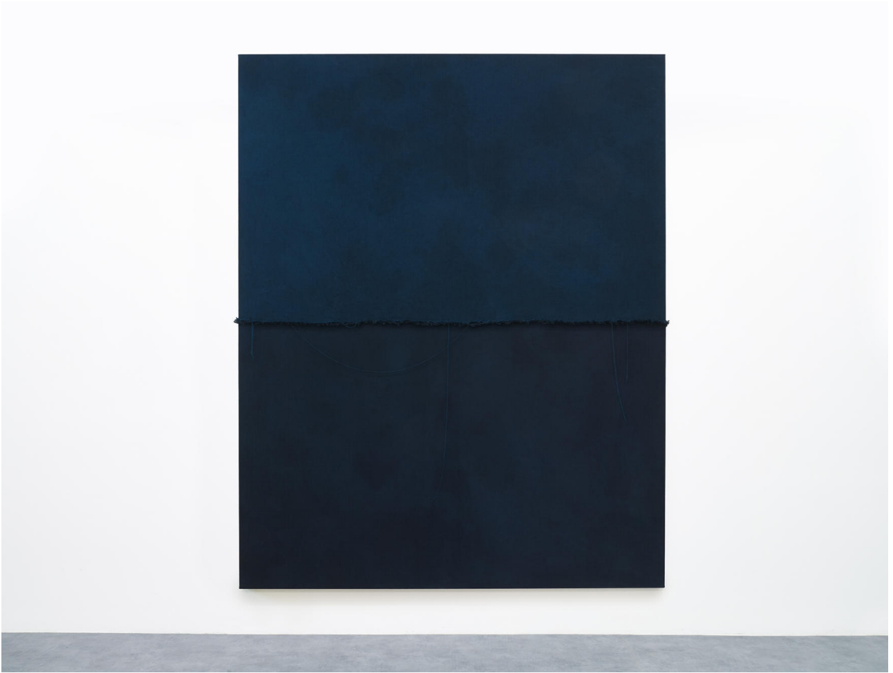
Hermann Bergamelli Verde, blu Dyeing with natural and chemical elements on fabric, stitching 250 x 200 cm 2021 Euro 5900