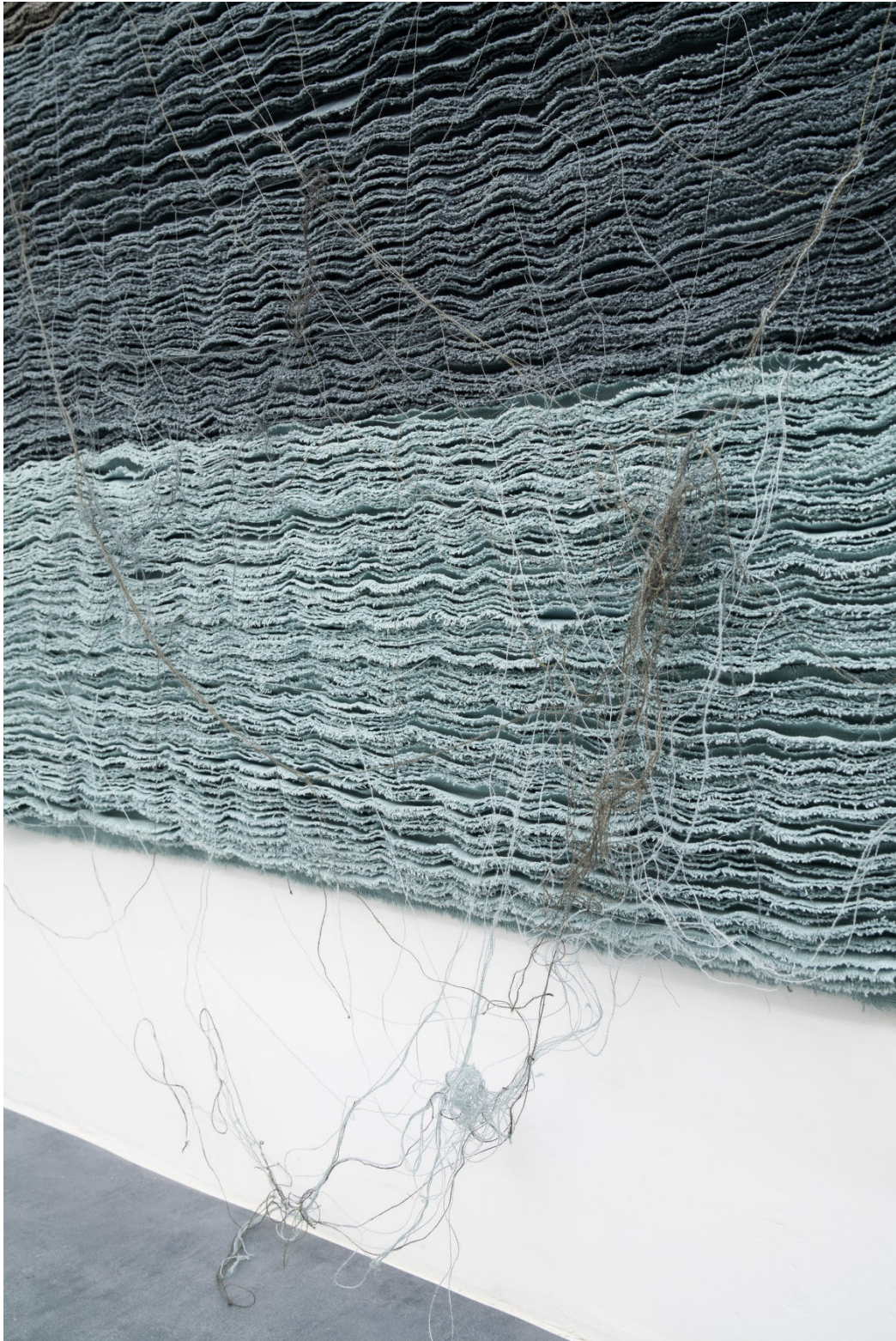
Hermann Bergamelli Grigio su grigio Dyeing with natural and chemical elements on fabric, stitching 240 x 140 cm 2020 Euro 4900 (detail)