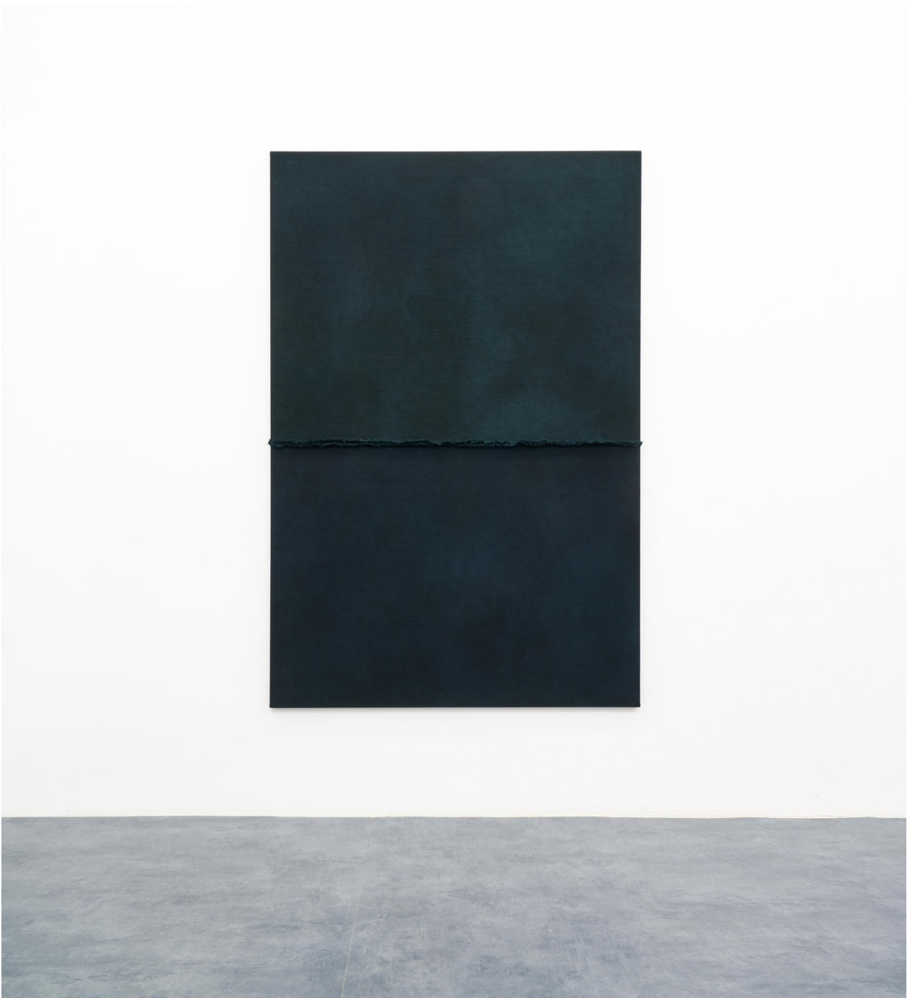
Hermann Bergamelli, Verde su verde verde, Dyeing with natural and chemical elements on fabric, stitching 180 x 120 cm, 2020 Euro 4000