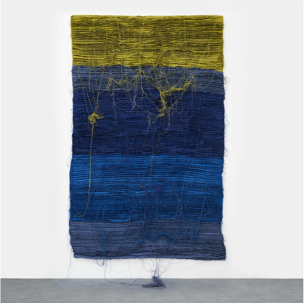
Hermann Bergamelli Giallo blu su grigio Dyeing with natural and chemical elements on fabric, stitching 240 x 140 cm 2020 Euro 4900