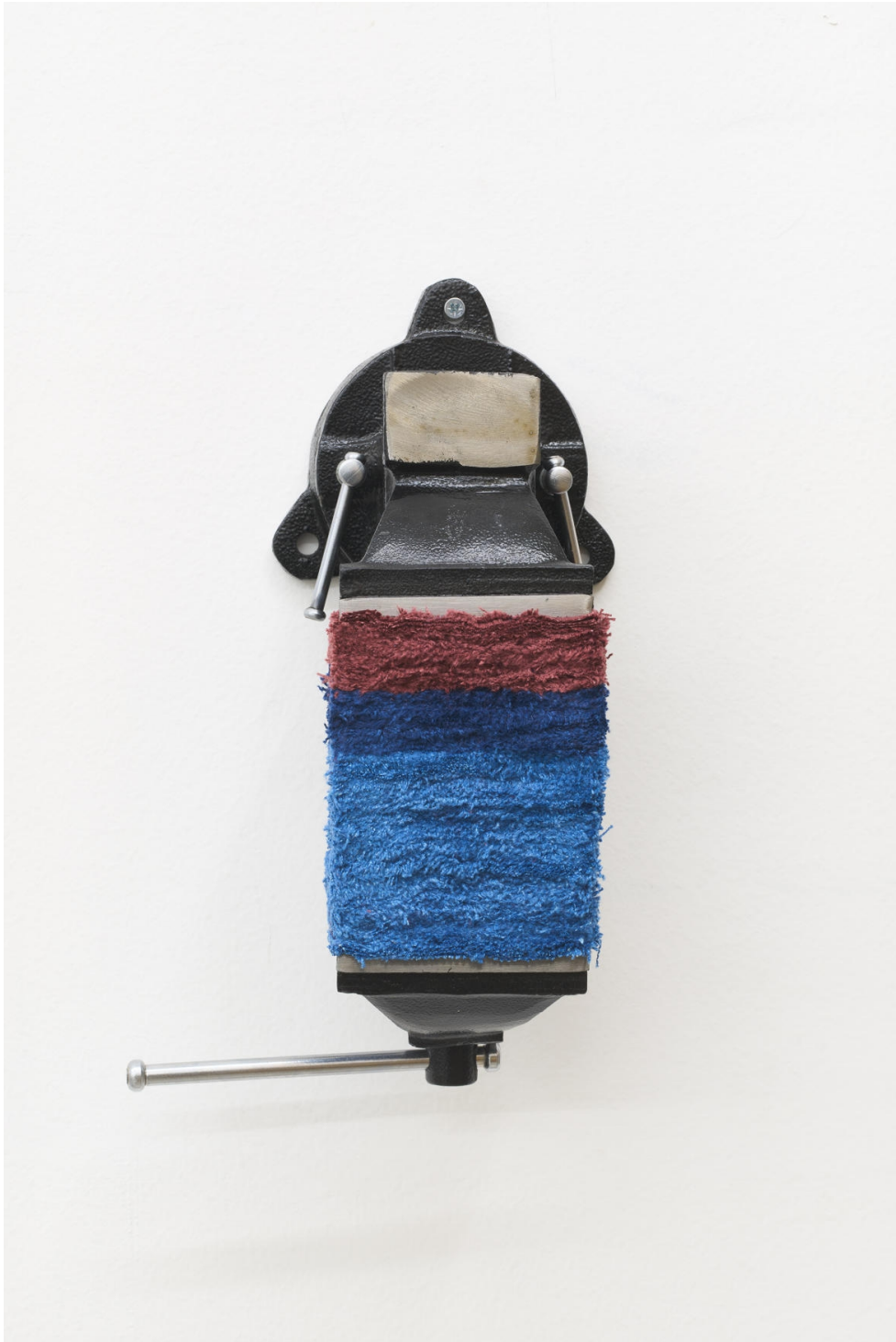
Hermann Bergamelli Rapido Dyeing with natural and chemical elements on fabrics, vice 35 x 15 x 15 cm 2021 Euro 1600