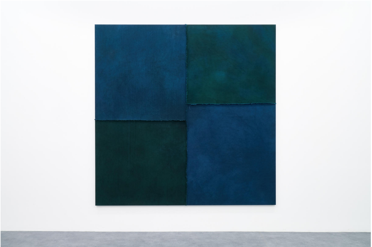
Hermann Bergamelli Verde nel verde blu Dyeing with natural and chemical elements on fabric, stitching 200 x 200 cm 2020 Euro 5200