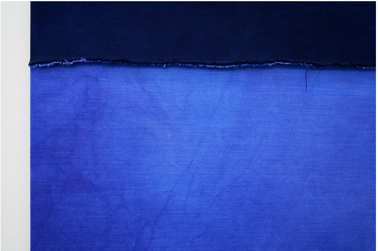
Hermann Bergamelli Blu Blu Dyeing with natural and chemical elements on fabric, stitching 180 x 120 cm 2020 Euro 4000 (detail)