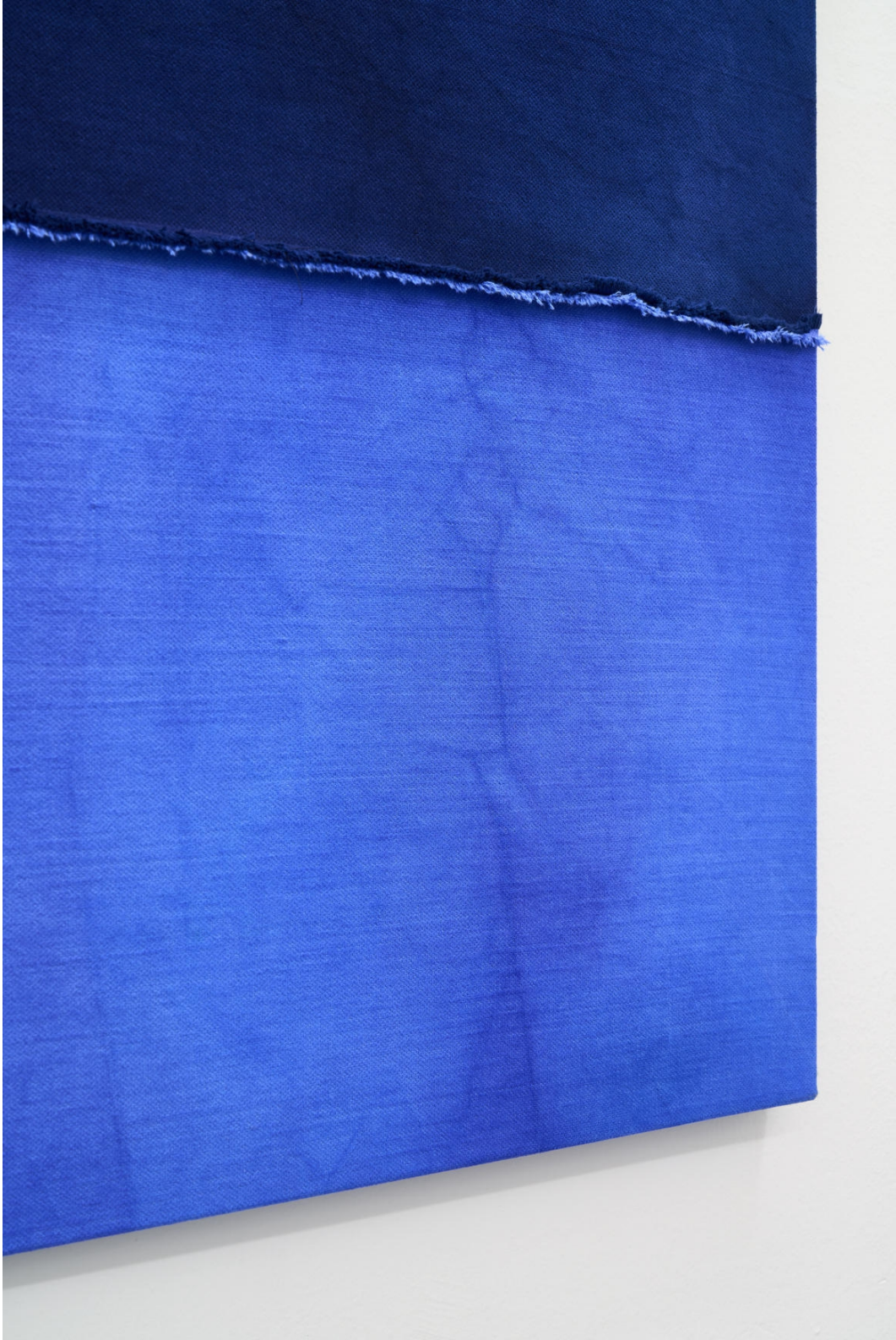
Hermann Bergamelli Blu blu Dyeing with natural and chemical elements on fabric, stitching 180 x 120 cm 2020 Euro 4000 (detail)