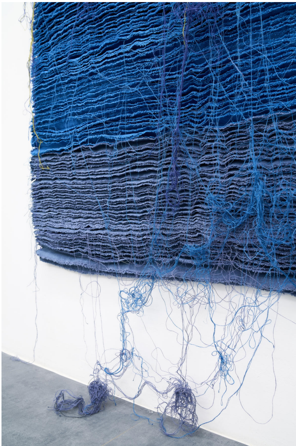
Hermann Bergamelli Giallo blu su grigio Dyeing with natural and chemical elements on fabric, stitching 240 x 140 cm 2020 Euro 4900 (detail)