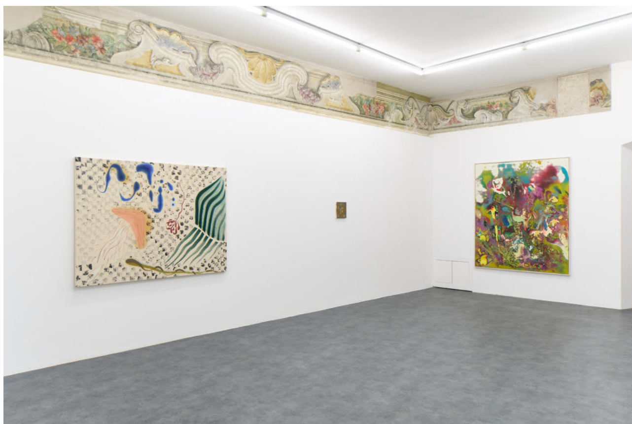
Dog in the window, A+B Gallery, Brescia, 2022