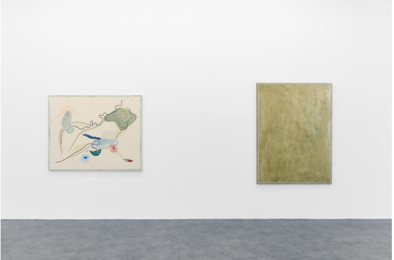
Dog in the window, A+B Gallery, Brescia, 2022