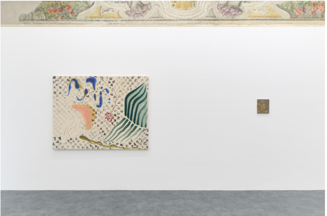
Dog in the window, A+B Gallery, Brescia, 2022