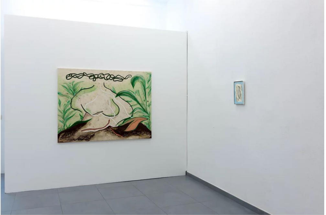
As a chance meeting between a cloud and a rubber stamp on a cusp of land, Ballon Rouge Collective at B.R.Club, Brussels, 2019