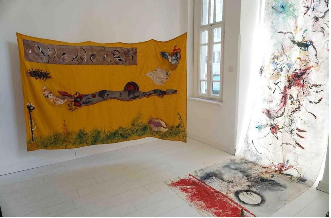
Text, silence, spectacle at Poşe, Istanbul , 2019