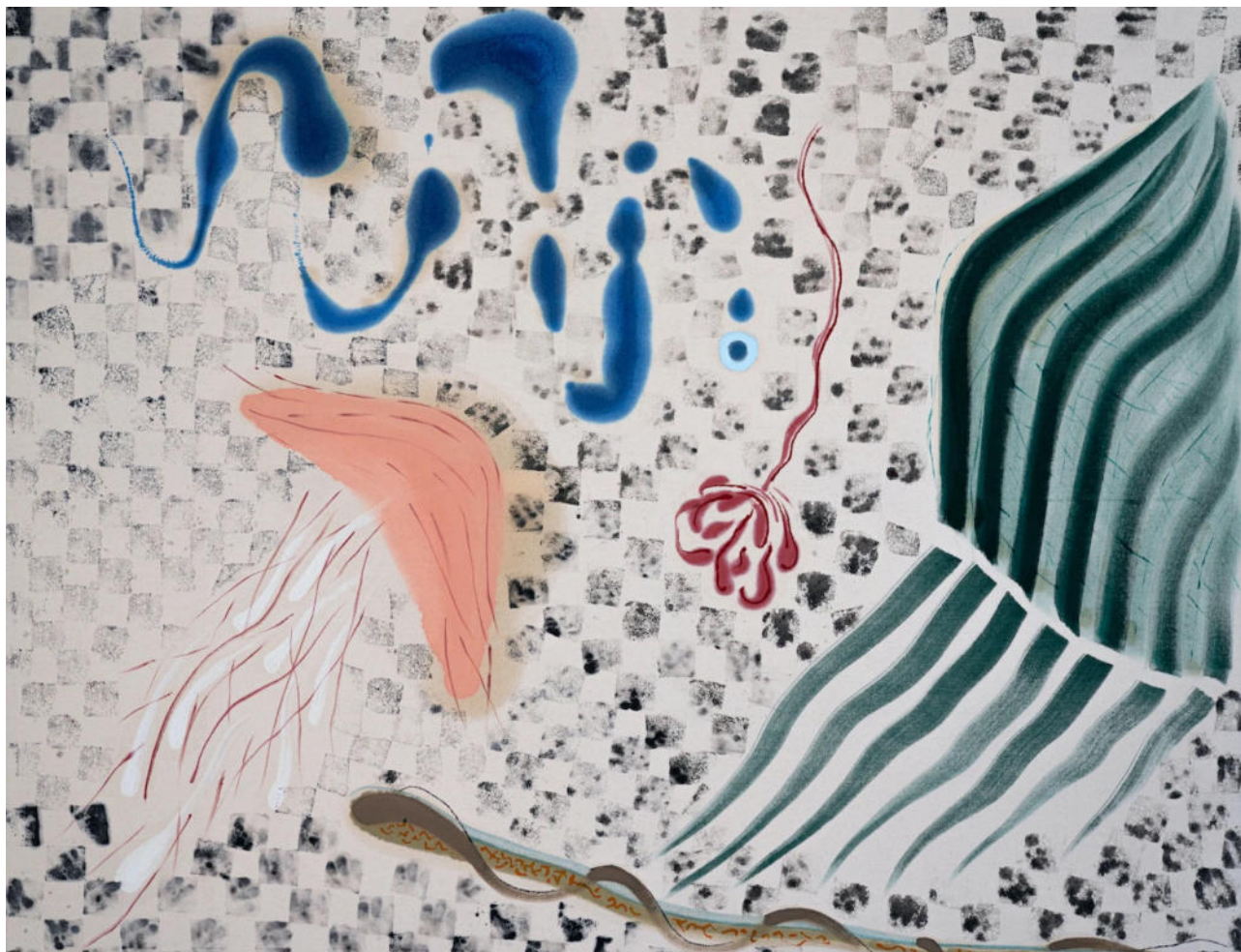
Sub la mer, 2020 oil, acrylic and ink on canvas 130 x 170 cm euro 6300