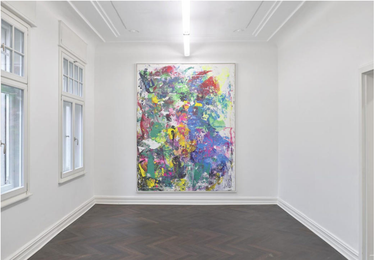
Die Tücken der Neuen Freiheit at Achenbach Hagemeier, Düsseldorf, 2017