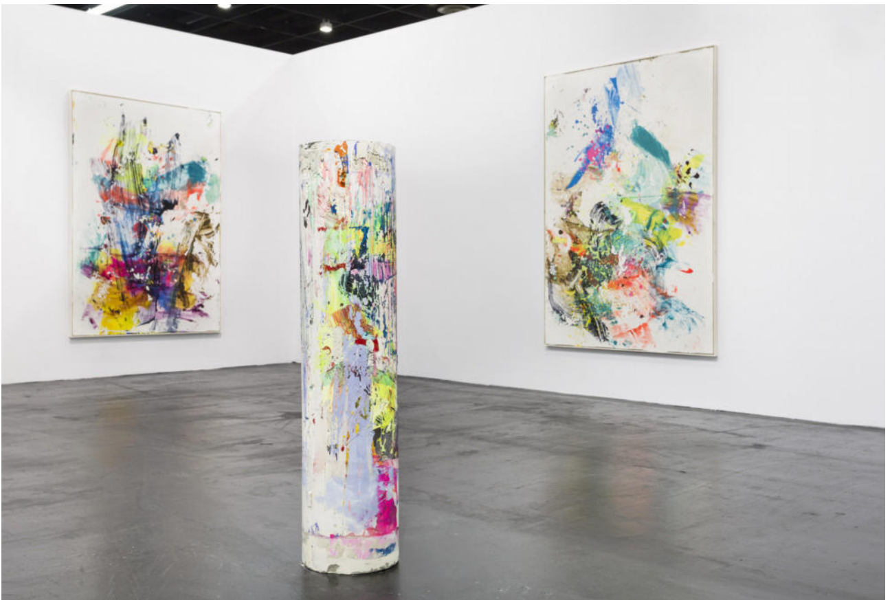
ARTCOLOGNE, solo booth A+B gallery, Colonia, 2018