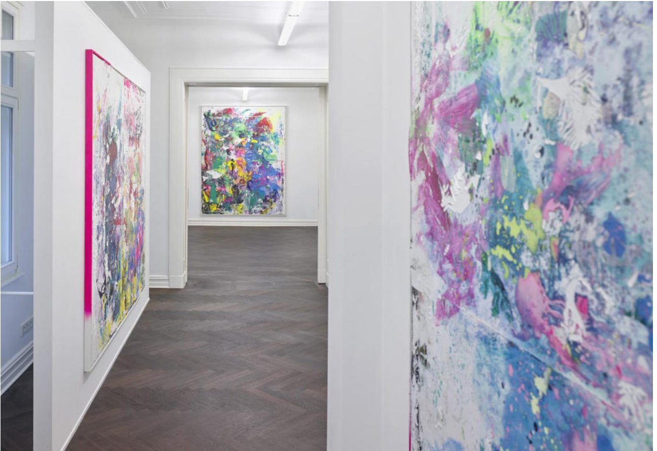
Die Tücken der Neuen Freiheit, at Achenbach Hagemeier, Düsseldorf, 2017