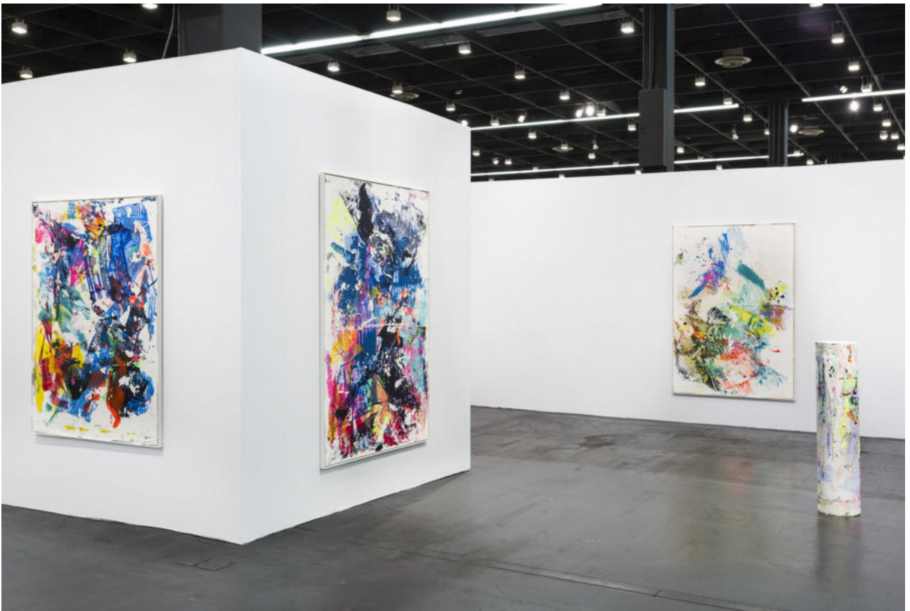
ARTCOLOGNE, solo booth A+B gallery, Colonia, 2018