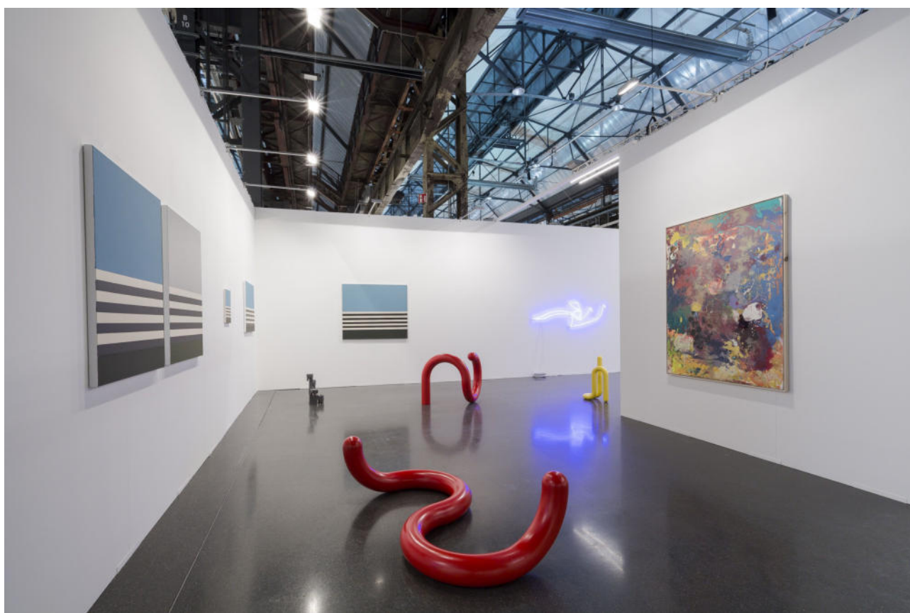
ArtDüsseldorf, A+B gallery, Düsseldorf, 2022