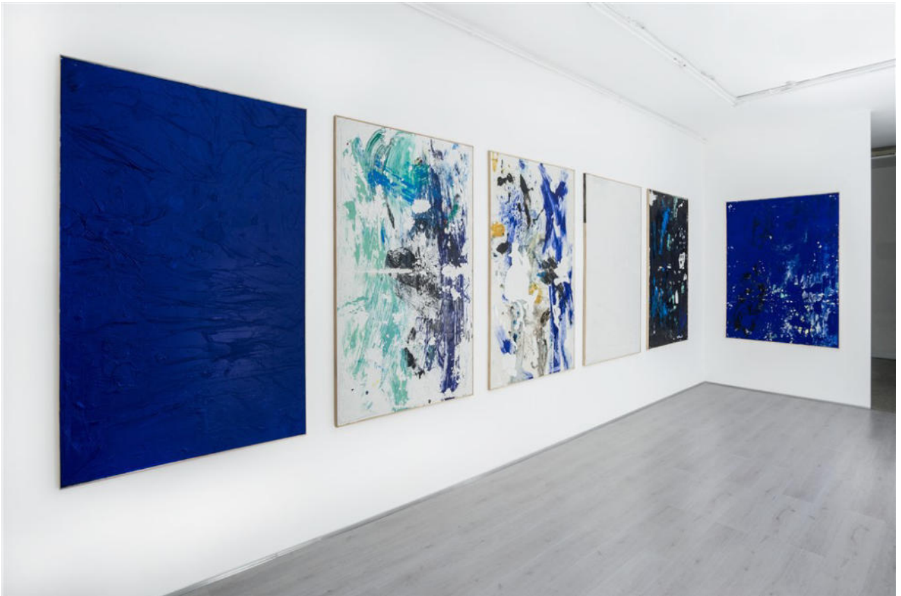
Monsieur Fanta! at A+B gallery, Brescia, 2015