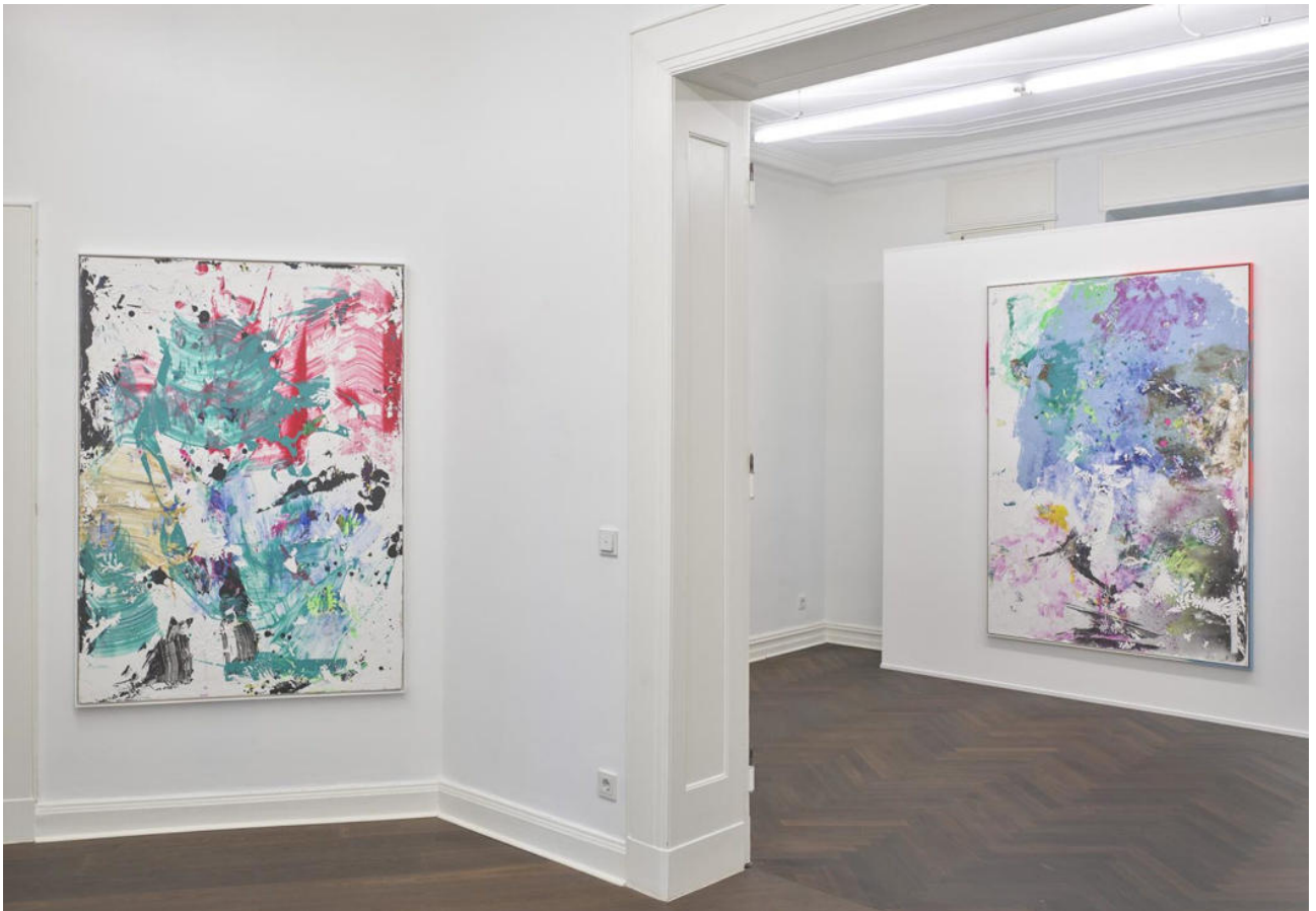
Die Tücken der Neuen Freiheit, at Achenbach Hagemeier, Düsseldorf, 2017