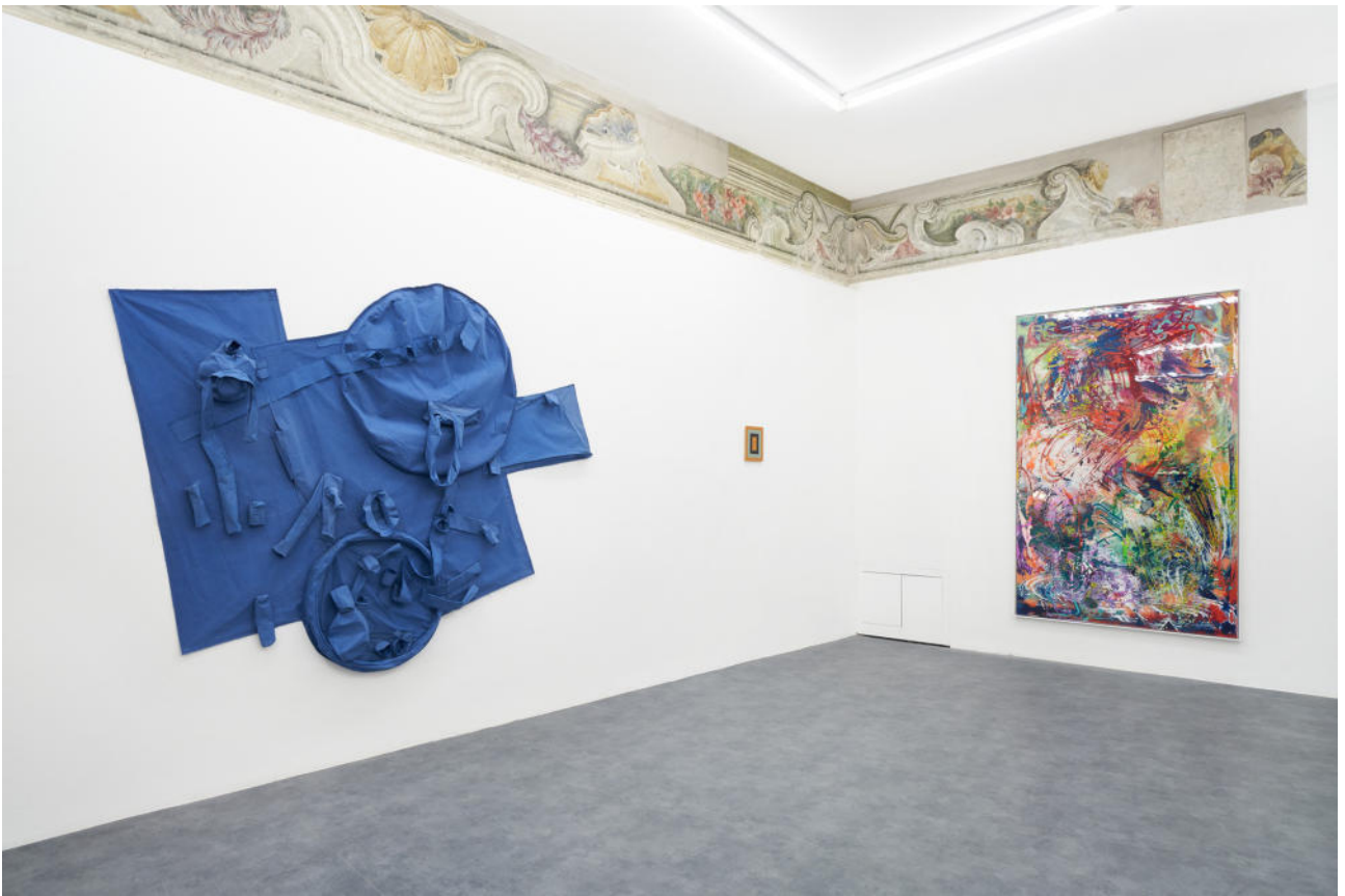
15 the waiting hall, group show at A+B gallery, Brescia, 2020