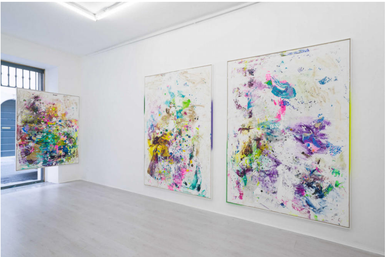
Firnt at A+B gallery, Brescia, 2017