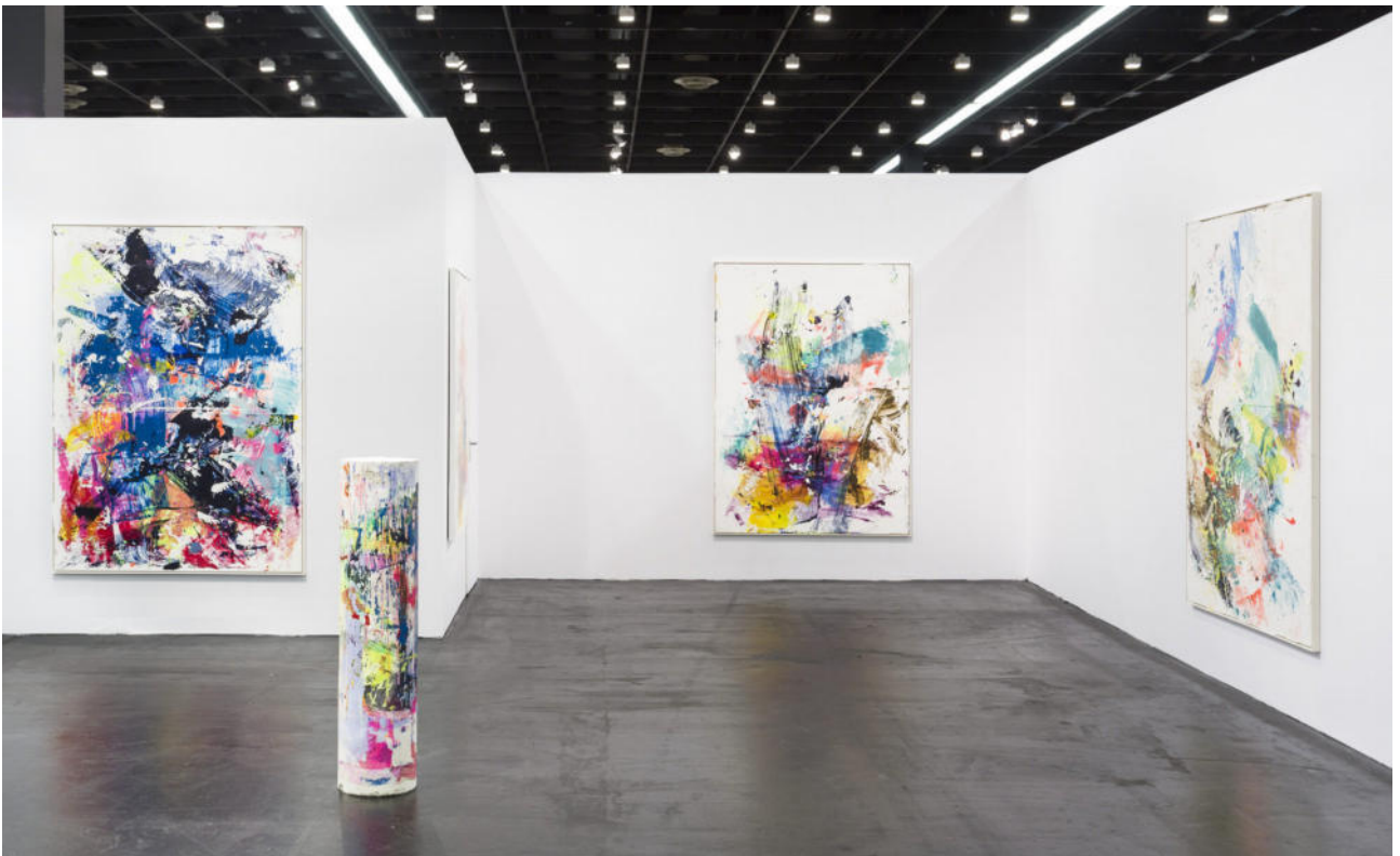
ARTCOLOGNE, solo booth A+B gallery, Colonia, 2018